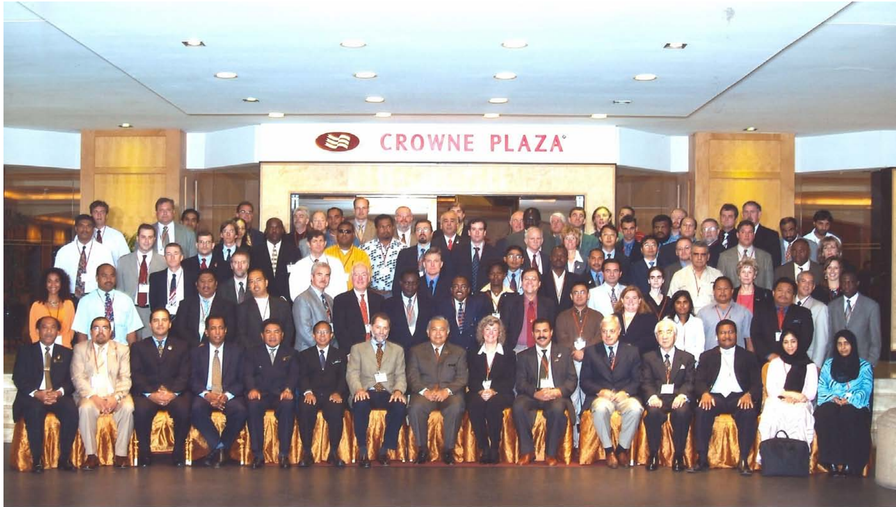
GLOBAL FISHERIES ENFORCEMENT TRAINING WORKSHOP ( GFETW ) 18-22 July 2005, KUALA LUMPUR