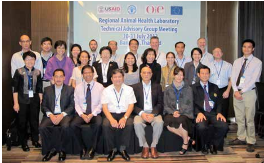
Participants and members of the Regional Animal Health Laboratory Technical Advisory Group Meeting held in Bangkok, Thailand

Participants at the FAO/OIE Regional Workshop on Swine Health Management in East and Southeast Asia, held in Ho Chi Minh city, Viet Nam in end August