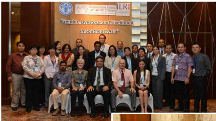
(ABOVE and RIGHT): Participants at the Gender, Livestock and Livelihood meeting in Bangkok

Recognizing the importance of the linkage between veterinary field epidemiology and laboratory components, FAO, in collaboration with the Australian Animal Health Laboratory (AAHL), conducted a Regional Laboratory Network Workshop on Strengthening of the Laboratory and Field Epidemiology Linkage on 20-31 May at the Faculty of Veterinary Science, Chulalongkorn University, Bangkok. The workshop's objectives were to foster appreciation for the communication required between laboratory and epidemiology field