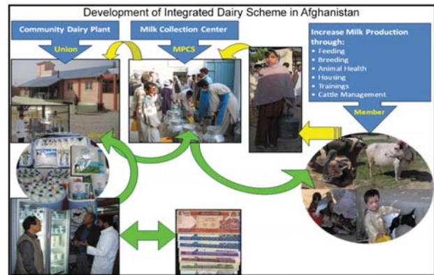
Dairy training sessions

Boosting protein in local diets is a very efficient way to fight widespread undernutrition and FAO has been actively involved in backyard poultry development in Afghanistan. Its poultry initiatives have been very