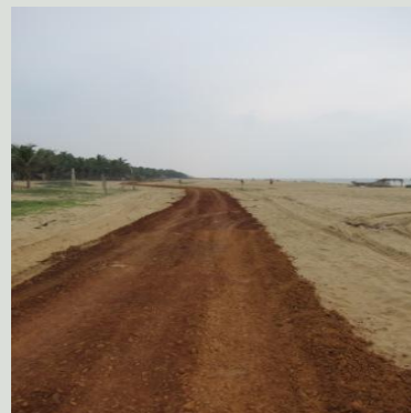
Figure: Access road constructed