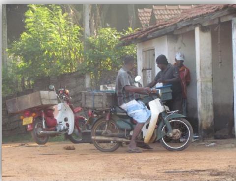
Figure: Fish buyers at the collector's shop

Fishers reported that prior to the access paths being built only 5-6 buyers would come to the beach to buy fish from the boats. As access was poor, buyers needed to park their bicycles on the main road and walk around 400 meters to the beach to buy the fish. Only small quantities could be bought since they could not carry them back to their bicycles easily. The majority of buyers would therefore purchase fish from collectors and fishers had no option but to deal with the collectors and to accept low prices.