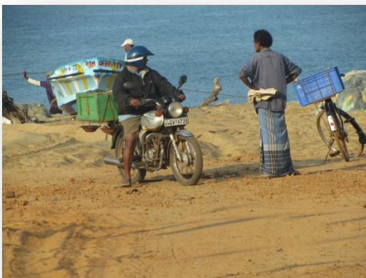
Figure: Buying fish in the beach