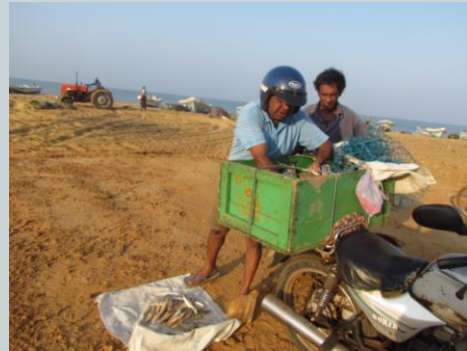
Figure: Fish buyers at the beach

Despite the fact that using four wheel tractors to drag seine nets is prohibited by law in Sri Lanka, this practice is commonly undertaken by seine net owners. Fishers report that the seine net fishers park their tractors on the access paths and then drive them onto the beach only when needed. By doing so it is easier to avoid any action by the authorities.