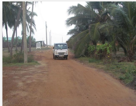
Figure: Trucks on the beach

The paths also allow refrigerated vehicles to access the beach. According to fishers, if they have a sizable catch they can call these vehicles to come directly to the beach so that the fish can be sent to Negombo market.