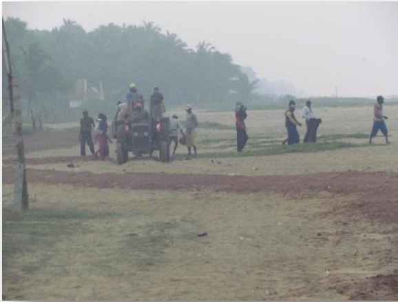
Figure: Illegal use of tractors in the beach