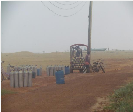
Figure: Transport divers' equipments

The newly constructed access paths have been very beneficial for divers in the area, who fish for sea cucumbers etc., to transport their tanks to the beach.