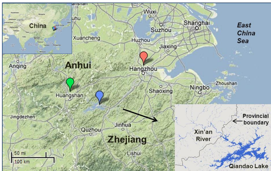
Figure 1 The Xin'an River and Qiandao Lake in Eastern China (adapted from Google Maps)

It has been more than a decade for an agreement reached by the two provinces on a trans-provincial payment scheme for watershed management. After the first outbreak of blue algae in part of the Qiandao Lake in 1998, representatives of the Zhejiang Province submitted a proposal during the National People's Congress (NPC), the highest legislative body in China, in 1999, asking the upstream Anhui Province to better clean floating rubbish in the Xin'an River. But in the next year's NPC, representatives of Anhui Province suggested that water pollution control of the Xin'an River should be included in the central government's total plan, which implied a request for financial support from the central government. Later in 2001, the former National Environmental Protection Bureau (which was upgraded to the Ministry of Environmental Protection in 2008) organized the first coordination meeting between the two provinces, but no progress was made [7].