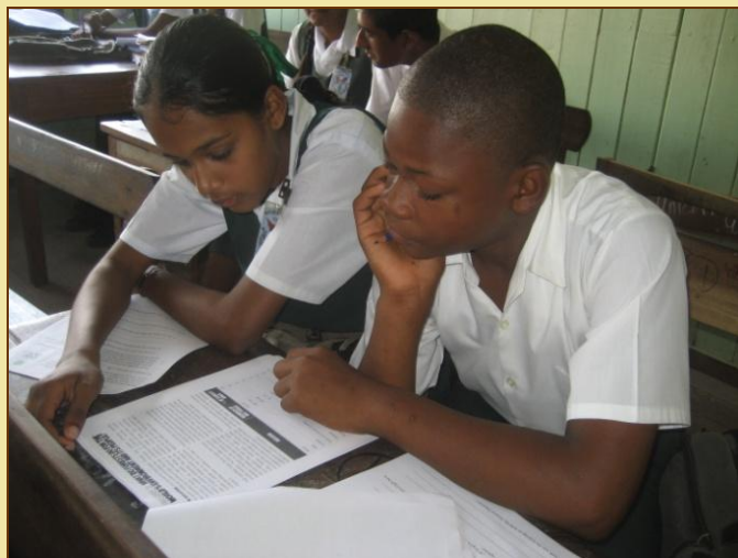
The Natural Inquirer editorial review board at work!

The second edition of Natural Inquirer: the World's Forests has now been published!