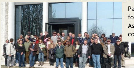
Participants to the Preparation for Global Forest Resources Assessments 2015 technical consultation

An important milestone in the work plan towards FRA 2015 has been the Technical Consultation on "Preparation for Global Forest Resources Assessments 2015" held in Ispra, (Italy) from 12-16 March 2012. The technical consultation has been co-organized with the EC Joint Research Centre in follow-up to recommendations by the Forest Resources Assessment Advisory Group and the Expert Consultation held in September 2011. The objective of the consultation was to provide guidance for the Global Forest Resources Assessment 2015 (FRA 2015) on scope and the content as well as the process for data collection and reporting. A total of some 60 specialists (representing close to 75 % of the global forest area) participated in the Technical Consultation, plus international and regional organizations, NGOs, private sector and academia. Working groups discussions focused on forest area, type and function, growing stock, protective functions, biodiversity, disturbance and degradation, measuring progress towards SFM, economics and livelihoods, projections, joint data collection and remote sensing.