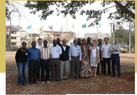
Participants from eastern and southern Africa to the land cover validation workshop in Nairobi (2009)

The Remote Sensing Survey is now in the process of completing a land use report that documents forest land use change from 1990-2005. This process involved over 200 experts coming from 106 countries, through 19 regional and national workshops, held between September 2009 and July 2011. The last workshop for the review and revision of the Remote Sensing Survey samples was held in Rome in 26-28 July. Five participants attended from Afghanistan, Japan, Kyrgyzstan, Morocco and Uzbekistan. The data is currently being analyzed with a report on forest Land-use changes due to be released at the UNFCCC COP in Durban in late November 2011 and on the dynamics of Land cover change in early 2012. Both reports are being produced jointly with the European Commission Joint Research Centre, with financial support from the EC.