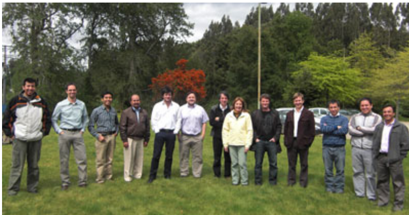
Participants from South America take part in the RSS training / validation workshop in Valdivia, Chile

As part of the FRA 2010 Remote Sensing Survey, an updated map of global percent tree cover circa 2005 has been produced by the Geographic Information Science Center at South Dakota State University.