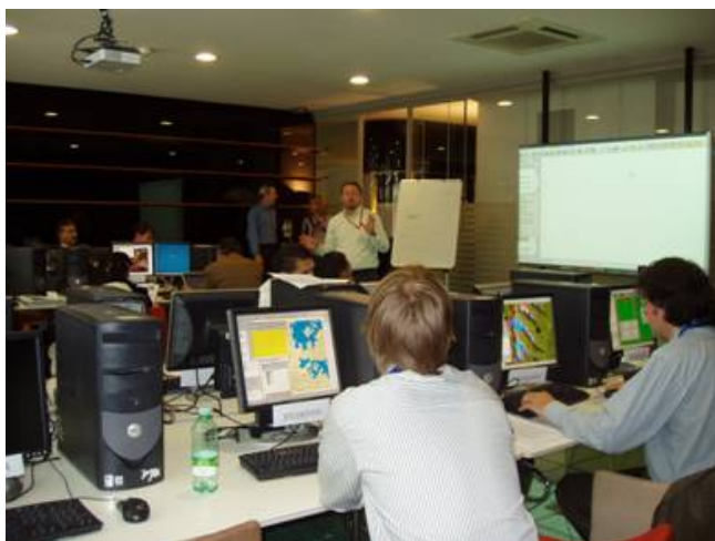
Participants learning to label Landsat images using FAO software

The workshop provided an overview of FRA 2010 Remote Sensing Survey methods and work of partner organisations. Countries in the Pilot study are being asked to process some test areas and provide feedback to FAO on the methods and systems to help refine the process before wider implementation. Three days training in the FAO computer lab was provided to learn how to use the remote sensing processing software for viewing and labelling the imagery. Other countries will be involved in similar training in regional workshops to be held after July 2009.