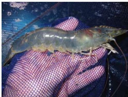
SPF Litopenaeus vannamei broodstock is now commercially available.