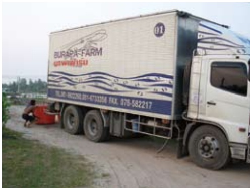
Sheer volume of aquatic animal traded sometimes makes it difficult to implement effective quarantine.

Quarantine, particularly of exotic species, can be an expensive activity. Responsibility for the costs of operating a Quarantine Facility and other related financial issues (e.g. costs of permits, supervision, diagnostic and other services, treatments, loss of stock due to mortality or their ordered destruction, etc.) should be clearly spelled out to all parties via legal documentation. Generally, the importer of a consignment of live aquatic animals should bear all costs associated with complying with the aquatic animal import standards.