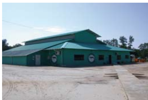
Closed biosecure L. vannamei hatchery.

On introduction into the quarantine area, the broodstock must be well acclimatized, the duration of acclimatization depending upon the temperature and salinity of the transport water.