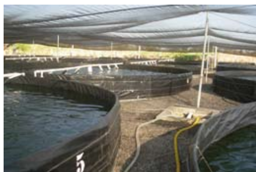
Biosecure Litopenaeus vannamei broodstock maturation facility.

The quarantine of all broodstock to be introduced into the hatchery is an essential biosecurity measure. Before being introduced into the production system, the broodstock should be held in quarantine and screened for subclinical viral infections (i.e. by PCR). Broodstock infected with serious