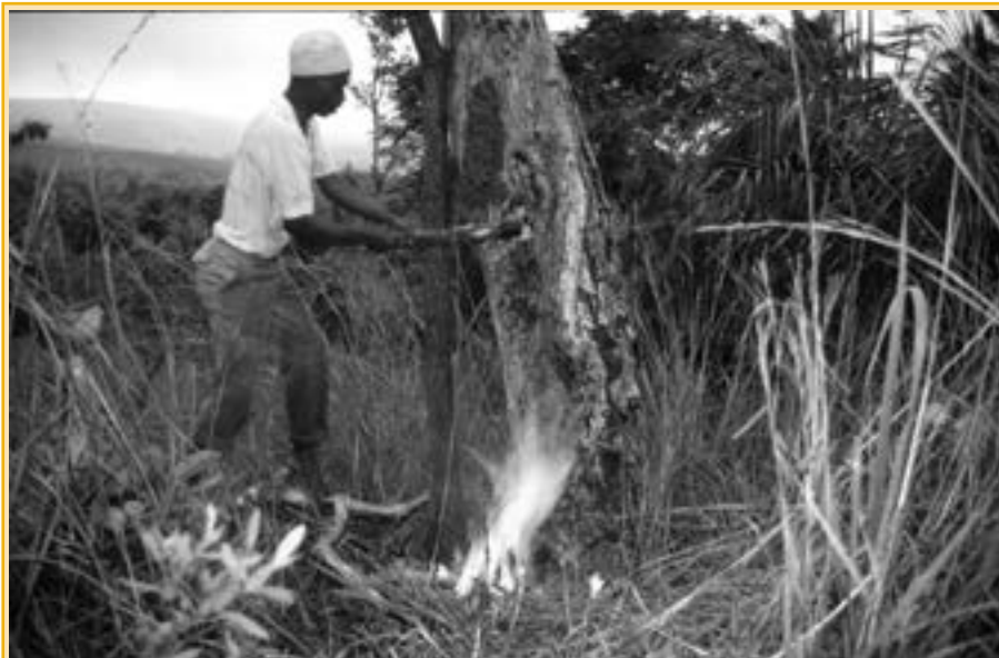
FIGURE 2 Farmer fells a tree to get at a beehive in its interior