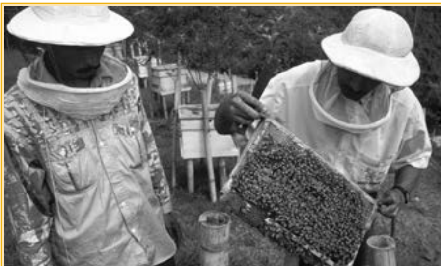
FIGURE 13 A movable hive frame in Nepal. Beekeeping is a new activity in the Shivapuri area. The aim of the FAO project is to improve the economical situation of the local people by developing income-generating activities

This ensures that honey alone is stored in boxes above the queen excluder and allows for an efficient honey harvest. In addition to the boxes and frames, a floor and roof are required, along with various other specialized items of equipment. Frame hive equipment should not be used unless the infrastructure exists for manufacturing it locally. Frame hives require well-seasoned timber, planed