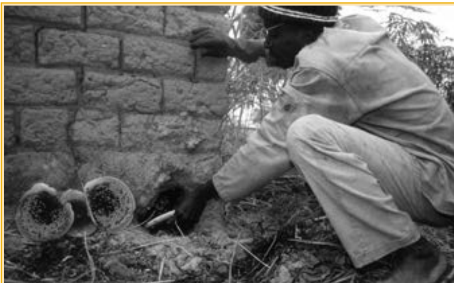
FIGURE 3 Removing honeycombs from a hole in a wall