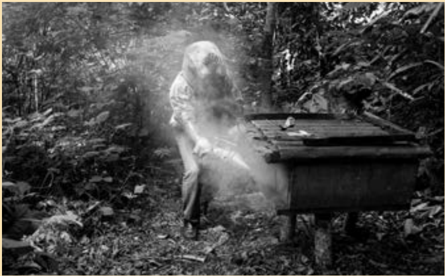
FIGURE 14 Smoking a hive for inspection and/ or harvesting of honey