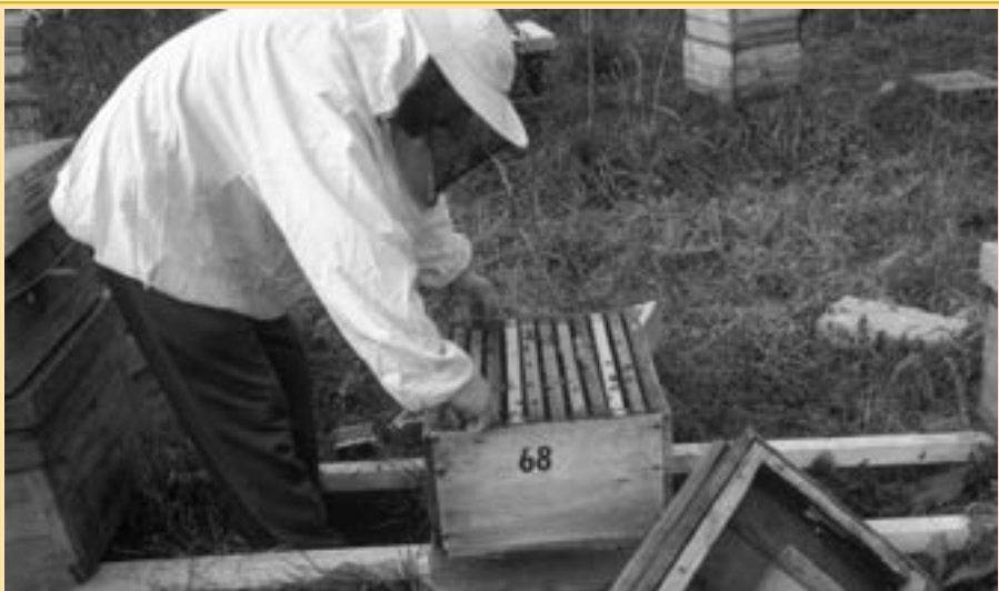
FIGURE 15 A small-scale farmer wearing protective clothing is checking on progress of hibernating bees after putting warm smoke in the boxes to wake them up. He is not wearing gloves because the bees were hibernating and there was no danger of being stung