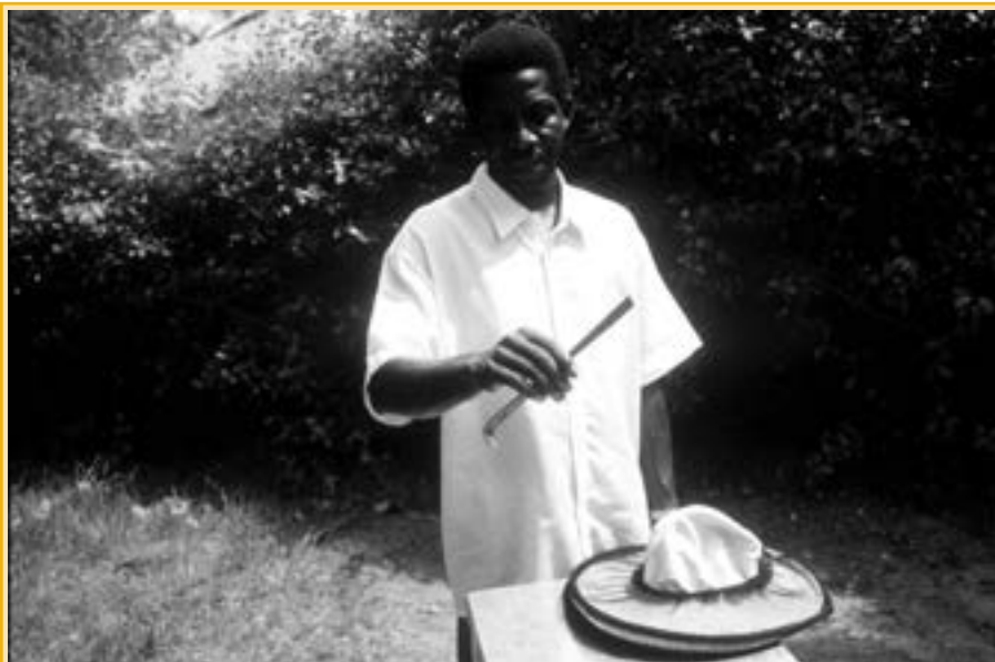
FIGURE 16 This hive tool is used to lift hive frames and help in other management practices. The hat with veil protects the worker from bee stings