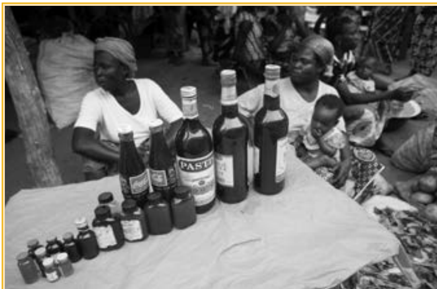
FIGURE 1 Vendors selling raw honey in a variety of recycled bottles at a market

knowledge required for such an enterprise are found within local traditions. As a business enterprise it offers not only diverse products, for example honey and wax among others, which can be sold in local markets and become an important source of regular income for farm families, but can also provide complementary services, such as crop pollination. Moreover bee products improve farm family nutrition and can provide for traditional health care remedies.