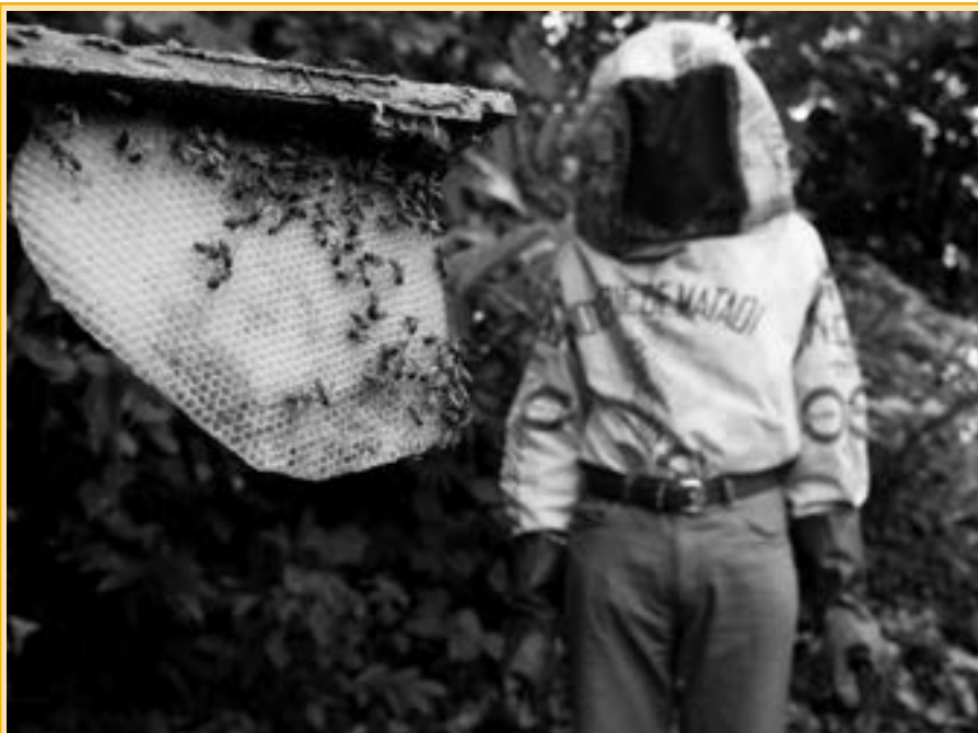
FIGURE 10 Bees on an unprotected comb in the Democratic Republic of Congo

Source: FAO.2009. Bees and their role in forest livelihoods, by N. Bradbear, Non-wood forest products No. 19, Rome