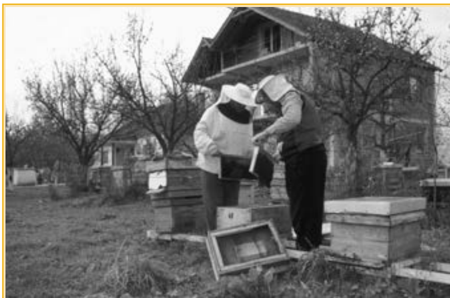
FIGURE 5 Small-scale farmers checking their hives in proximity of the farm homestead

travel far to tender the enterprise and it can be a ready source of cash in times of need, as bee products can be sold to neighbours or in local markets. This enables women to be part of an economic activity, which can provide them with income and an independence that can support them in difficult times. It is also a flexible activity, where there is no need for constant tendering, for example as with livestock and crops, and hence allows women to follow other matters on farm as well.