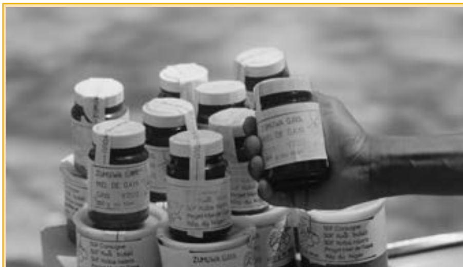
FIGURE 8 Pots of honey on sale at a roadside market in Niger

In some countries there are charges made for pollination services carried out by bees on commercial crops. This has a value for the commercial crops as not only it increases yields, but also increases quality of the crops. This means that there is potential to charge fees for pollination services carried out by small-scale farmers' bees in their local areas.