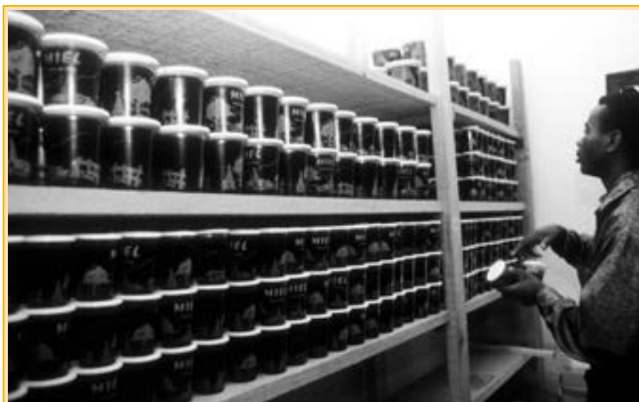
FIGURE 18 Honey being sold in plastic and transparent jars, with a logo and label printed on them

Marketing bee products that have been processed requires packaging. Typically in local areas small-scale farmers use whatever they can find, for example recycled bottles and jars. In such cases it is important that not only the packaging is clean and free from odours and consumers can see the bee products, for example the colour of the honey, but it is also not excessively heavy. For example recycled glass jars are heavy and may break if stacked and/or improperly handled. Plastic containers may be preferable, but may be difficult to obtain. Importantly whatever the