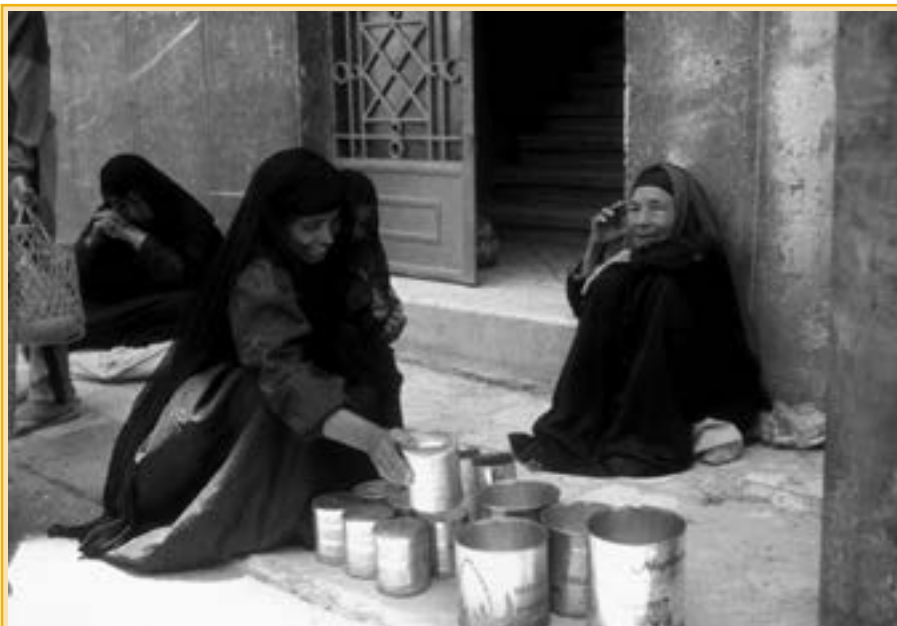
FIGURE 17 Women selling honey in Egypt

in terms of bee products, quantities required and quality, but small-scale farmers have access to such markets and are able to compete with other small-scale farmers who are also selling bee products.