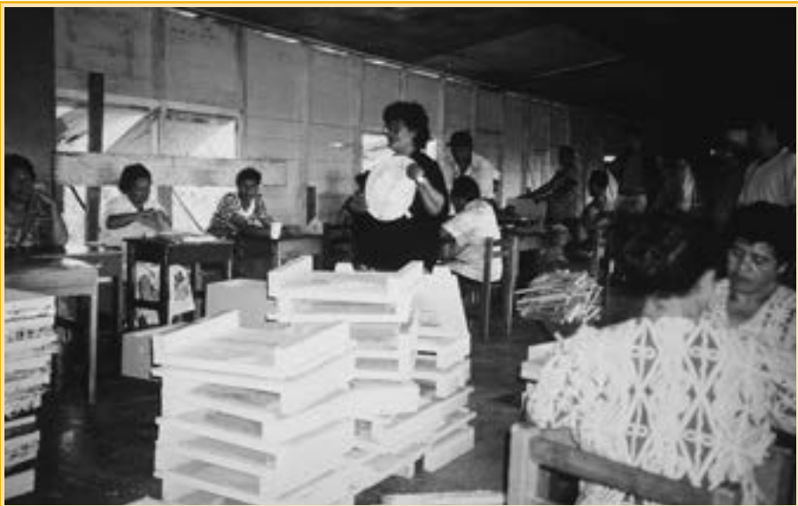
FIGURE 9 A women's group assembles beehives as part of an effort to provide a new source of income for the village

Beekeeping can also create social benefits as for example when small-scale farmers join together to form an association, either formal or informal. This collaborative work, which fits in very well with beekeeping, especially during honey harvest time, can create scope for working together within a community and the people involved can see and experience the advantages and benefits of collaboration and social harmony.