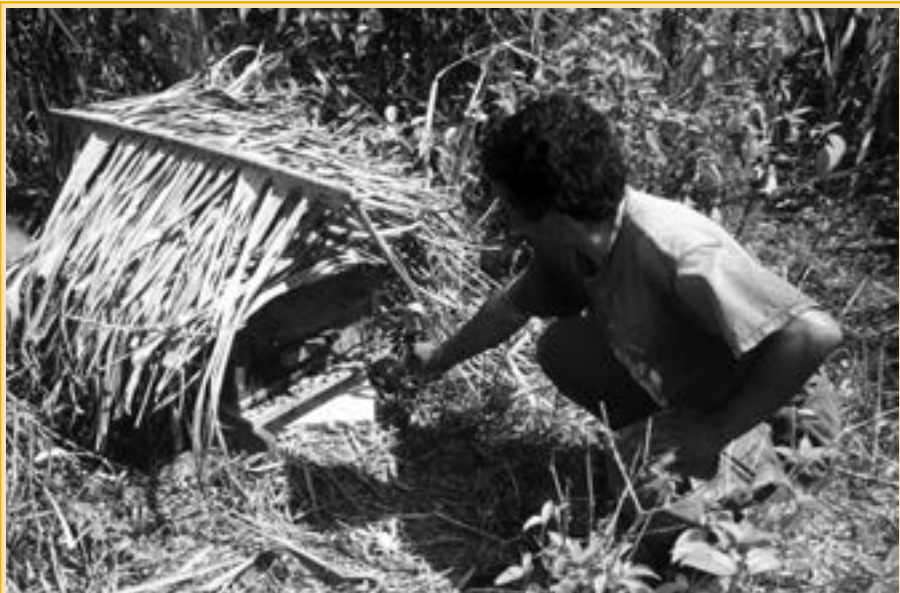
FIGURE 12 New model beehive in Madagascar with a palm cover to protect it from the sun

In hot climates, wild-nesting colonies always choose a shady spot for their nest, near to a water supply. The easiest way to protect colonies from the sun is to place them under shade trees in a green grassy area. If no shade trees are available then artificial shades must be constructed. If a large number of hives are to be shaded and a long shade is to be constructed, then it should run east-west to give maximum benefit. Hives can also be painted white or another light colour to reflect rather than absorb heat.