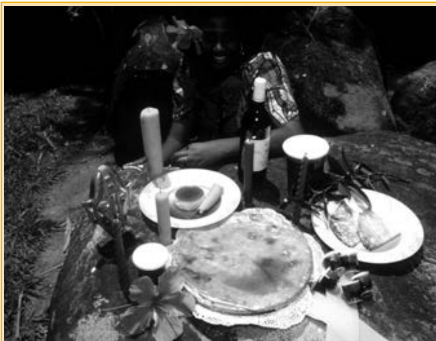
FIGURE 7 A selection of products made from honey and beeswax

Processing is not only important for higher incomes, but also for food security and availability. Bee products that have been appropriately processed are available year round for farm family consumption, but also for consumption by customers in local communities