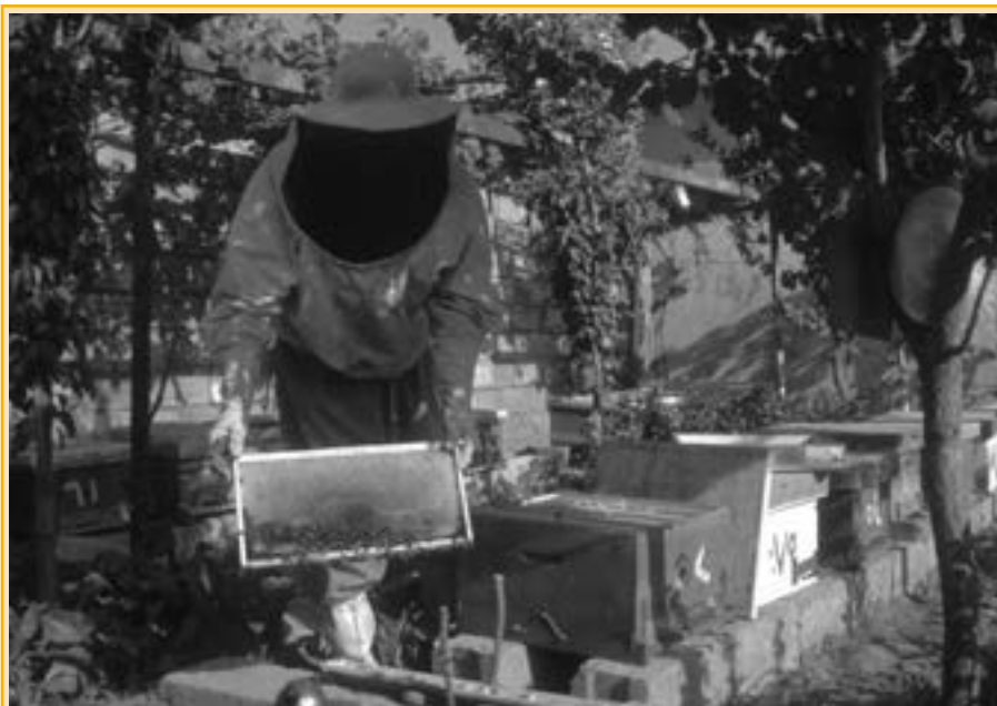
FIGURE 4 Beekeeping: increased populations of honeybees are required for optimal pollination of food crops and for the production of increased quantities of honey

Beekeeping is a lucrative trade even using simple management