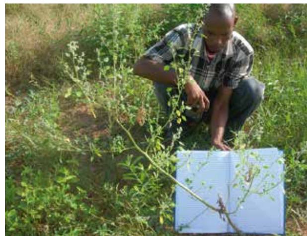
Figure 3. Plant from the variety 'BO78' during the rainy season in 2008, with fungal damage (unidentified) on the panicle that caused the entire apical panicle to abort and the plant to become bushy (many branches).

The quinoa seeds that arrived in Mali for the first time were assessed for their capacity to germinate at successive stages, involving quality assessment in storage conditions at ambient temperature. Temperatures ranged between 21°C and 26°C, with extremes (outside ambient temperature) of 45°C in the dry season and maximum inside ambient temperatures around 10°C less. Maximum ambient humidity was quite high in all periods (> 50%), therefore the seed weight was assessed before and after 3 months of storage. Once the first seeds were produced in Mali, germination was assessed following 12 hours in damp cotton under laboratory