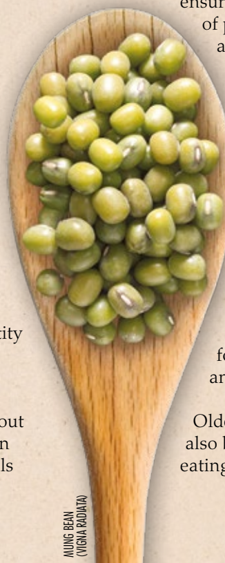
MUNG BEAN (VIGNA RADIATA)

Older people can also benefit from eating pulses.