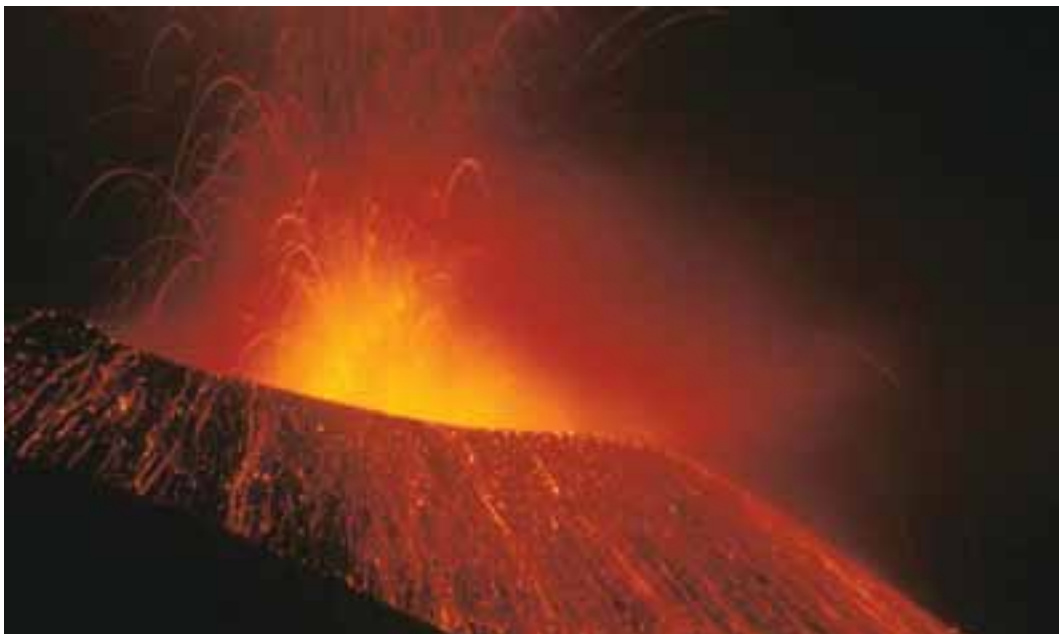
Chile's Lonquimay Volcano erupting

No viable seeds survived the debris avalanche or landslides and the very few surviving plants developed from rootstocks or stems that were moved by the landslide and came to rest near the surface (Turner, Dale and Everham, 1997). By 1994, vegetation cover on the debris avalanche had gradually increased from zero to 35 percent and was composed of early successional species with wind-dispersed seeds, a few conifers and red alder ( Alnus rubra ) (Turner, Dale and Everham, 1997). Mudflows washed away most of the understory vegetation and small trees; large trees, those taller