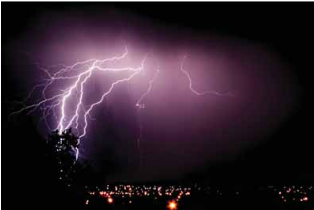
Lightning strikes, Canberra, Australia

Tall trees tend to be the most vulnerable to lightning strikes, especially those growing singly in open areas such as on hills, in fields, near water or in urban environments. The likelihood of a strike is greatest on exposed ridges, summits, slopes and other convex surfaces (Päätaalo, 1998). Lightning can impact a tree's biological functions and structural integrity. Along the path of the strike, sap boils, steam is generated and cells explode in the wood, resulting in strips of wood and bark peeling or being blown off the tree (Clatterbuck, Vandergriff and Coder, 2011). Trees may survive if only one side of the tree shows evidence of a lightning strike; however when the strike completely passes through the trunk, trees are usually killed. Many trees can suffer severe internal or below-ground injury despite the absence of visible, external symptoms when the lightning passes through the tree and dissipates in the ground (Clatterbuck, Vandergriff and Coder, 2011). Major root damage may cause the tree to decline and die. Lightning-induced mortality can create gaps in forest canopies (Magnusson, Lima and de Lima, 1996).