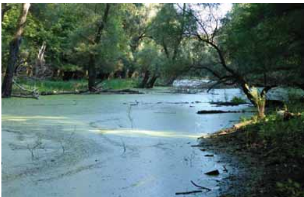
Flooded forest, Hungary

Flash floods can occur after heavy storms or after a period of drought when heavy rain falls onto very dry, hard ground that the water cannot penetrate (WMO, 2011). Such events may have much more impact on forests, especially in areas not accustomed to high waters.