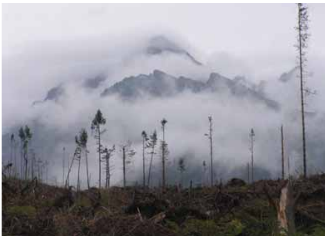
Storm damage, Slovakia

In some areas, storms have been causing increased damage to forests in recent decades (Schelhaas, Nabuurs and Schuck, 2003). In Europe, for example, storms cause more than 50 percent of all damage to forests and thus they have become such a major concern to the forest sector that the Directorate-General for the Environment of the European Commission commissioned a study into the problem.