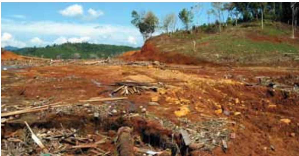
Soil erosion and debris resulting from the 2004 Indian Ocean Tsunami, Indonesia

In Indonesia, the hardest hit country, the degradation and conversion of mangroves into shrimp farms exacerbated the damage caused by the tsunami (Adger et al. , 2005; Srinivasa and Nakagawa, 2008; UNEP, 2005). It was estimated that almost 49 000 hectares of coastal forests (not including mangroves) were impacted by the tsunami representing an economic loss of US$21.9 million (UNEP, 2005). Approximately 90 percent damage to 300-750 hectares of mangrove forests was also noted representing a loss of US$2.5 million (UNEP, 2005). Only about 306 hectares of mangrove forests were impacted by the tsunami in Thailand representing less than 0.2 percent of their total area (Srinivasa and Nakagawa, 2008; UNEP, 2005). In some areas in Sri Lanka, large mangrove trees were uprooted and found far from the beach (UNEP, 2005). The tsunami also caused widespread impacts to mangroves and coastal vegetation in the Seychelles and the Maldives. Direct impacts to the mangroves were caused by inputs of sand and silt that covered the pneumatophores (breathing roots).