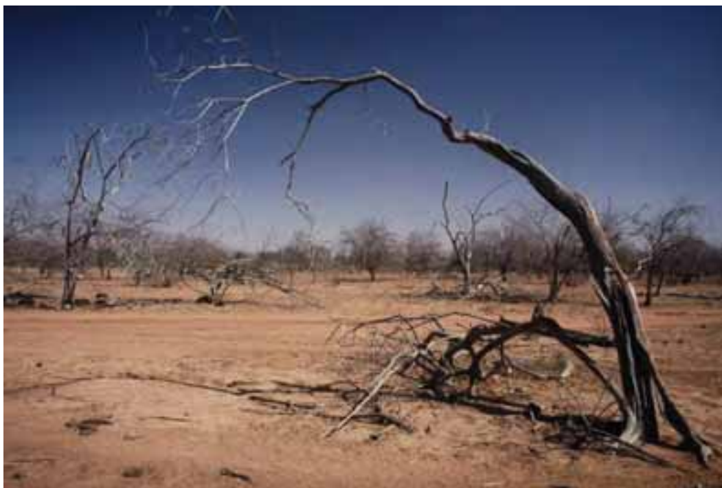
Dead vegetation in drought-stricken area, Senegal

Quaking aspen ( Populus tremuloides ) in Western Canada exhibited steep productivity declines and dieback after a particularly severe drought in 2001-2003, with effects continuing for years (Hogg, Brandt and Michaelian, 2008). Impacts were exacerbated by attacks of defoliating and wood-boring insects and pathogens (Hogg and Bernier, 2005; Hogg, Brandt and Michaelian, 2008). Steep growth declines and stand replacement of European beech ( Fagus sylvatica ) at the lower edge of its range has been observed in Spain and other southern European countries in response to drought (Jump, Hunt and Peñuelas, 2006). In Italy, Spain and Portugal native oaks are declining due to warming,