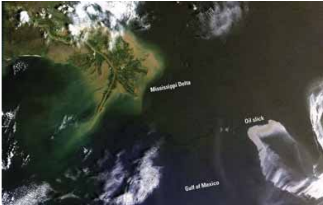
Oil spill in the Gulf of Mexico after the explosion of the Deepwater Horizon oil rig, 2010

The severity of the impacts of oil spills on mangroves are dependant on the amount of oil spilled, the type of oil spilled (including additives), the amount of time the oil remains near the mangroves, and the weathering time of the oil itself (NOAA, 2010). Lighter oils are more acutely toxic to mangroves than heavier oils and increased weathering generally lowers oil toxicity.