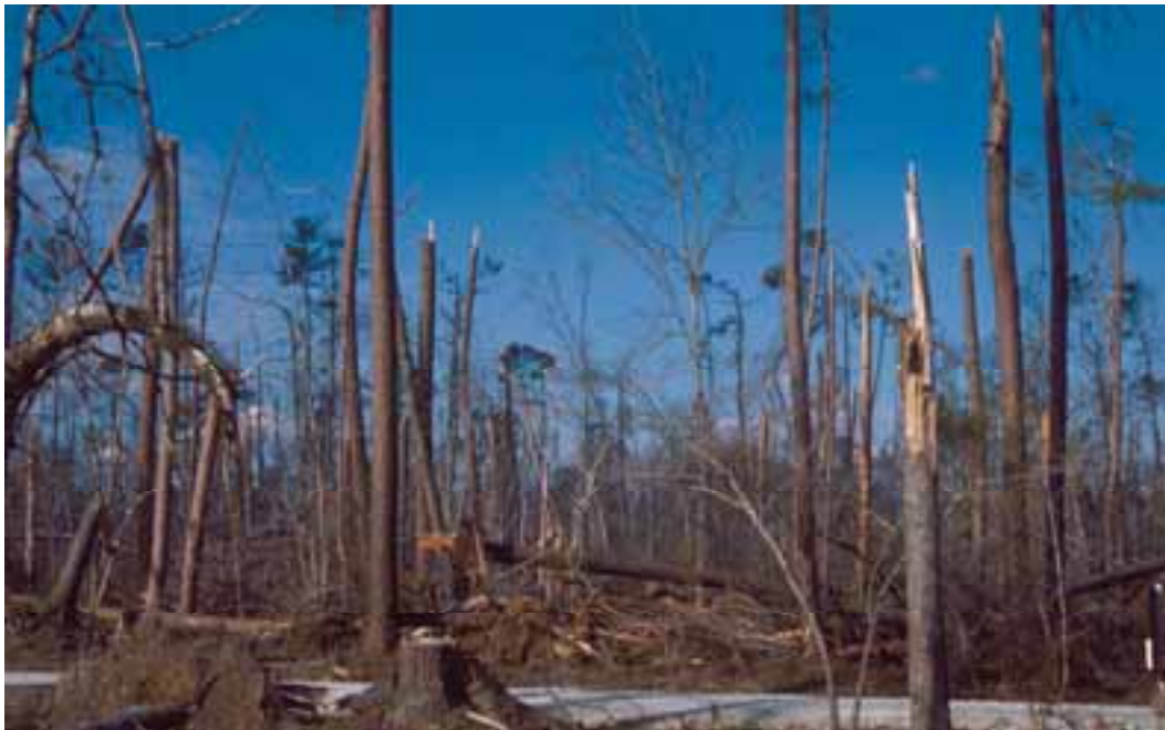
Hurricane Hugo damage, South Carolina, USA

As a tropical cyclone makes landfall its energy is transferred directly to coastal regions over a large area by high velocity winds, with effects extending inland for hundreds of kilometres during severe events (Stanturf, Goodrick and Outcalt, 2007). Three primary features of cyclones that cause damage are rainfall, storm surges and winds.