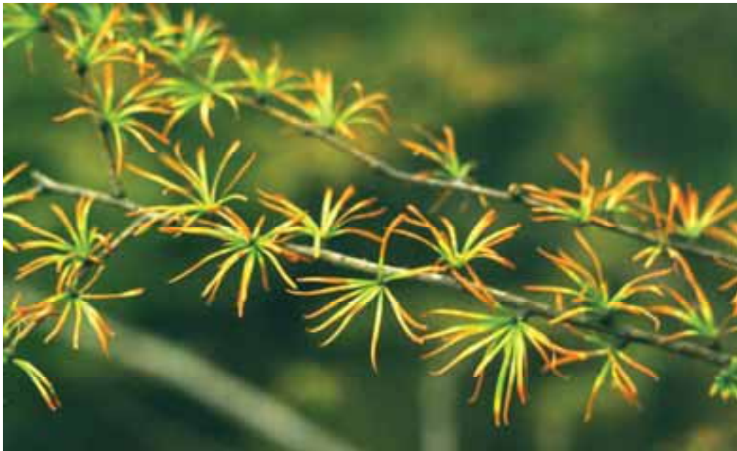
Air pollution damage to European larch ( Larix decidua ), Czech Republic

The deposition of atmospheric nitrogenous pollutants emitted from industrial, urban and agricultural sources is also of great importance in that they affect growth, biodiversity and biogeochemical cycles in forest ecosystems in many areas (Bytnerowicz et al. , 2008). Nitrogen oxides ( NO_x ) result in altered plant growth, enhanced sensitivity to secondary stresses, and eutrophication (Emberson, 2003). At low levels and in nitrogen-limited ecosystems, such as boreal forests, nitrogen may enhance growth. NO_x , ammonia ( NH_3 ) and nitric acid ( HNO_3 ) vapour may have direct phytotoxic effects but only at high concentrations (Bytnerowicz, Omasa and Paoletti, 2007).