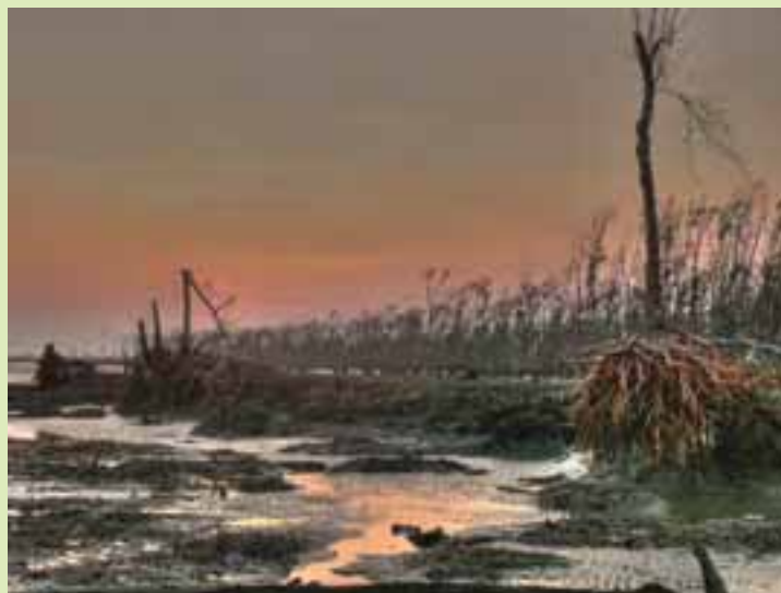
Damage to the Sundarban mangrove forests in Bangladesh after Tropical Cyclone Sidr

On 15 November 2007 Tropical Cyclone Sidr hit Bangladesh with wind speeds of up to 240 km/h causing significant damage to life, livelihoods and productive infrastructure. Approximately 8.7 million people or nearly 2 million households were affected (FAO, 2008). Nearly 1.5 million houses and some 4.1 million trees were damaged. The Sundarban mangrove forests, the largest such forest in the world (140 000 hectares) and a UNESCO World Heritage Site, incurred severe damages. They form a natural buffer protecting millions of people in Bangladesh from the Bay of Bengal. In addition to significant environmental and ecological functions, the Sundarbans also play major social and economic functions and many communities depend on them for their livelihoods. The area is also known for its wide range of fauna, including 260 bird species, the Bengal tiger and other threatened species such as the estuarine crocodile and the Indian python (UNESCO, 2011).