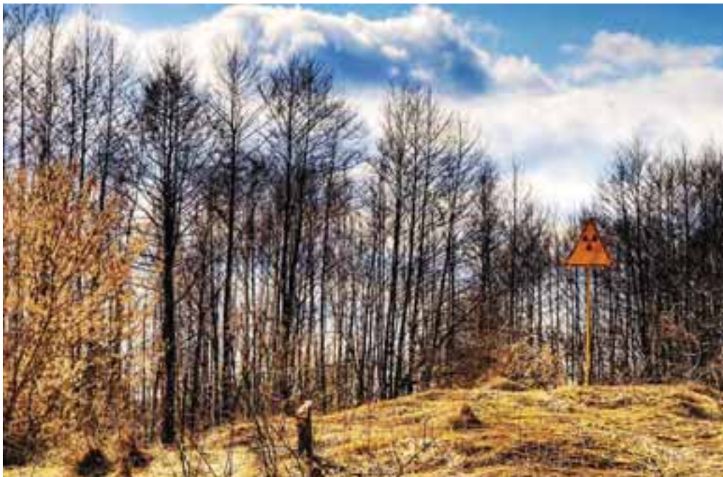
Radioactive contamination of forests in the Exclusion Zone at Chernobyl, Ukraine. This forest became known as the Red Forest as the trees died and turned reddish-brown in colour.

More recently, on 11 March 2011 in Japan, a magnitude 9.0 earthquake and associated tsunami damaged the power systems of the Fukushima Daiichi nuclear power plant causing cooling systems to fail. A series of gas explosions followed. Reports from the Government of Japan indicated that several radionuclides of consequence to human health, including Iodine-131 and Caesium-137, were found in the soil, vegetation and in animals, or their products; some of which exceeded acceptable levels (FAO/IAEA, 2011). While no data were available at time of print on the impacts of contamination on forests in the region, lessons learned and precautionary measures lead to recommendations that people refrain from hunting, gathering forest products and burning fuelwood. The situation in Japan illustrates the severity of the impacts of geophysical events on infrastructure whereby a sophisticated and well-prepared society can quickly experience situations normally associated with developing countries, such as large-scale food shortages, water and shelter crises, logistics collapse and the displacement of hundreds of thousands of people.