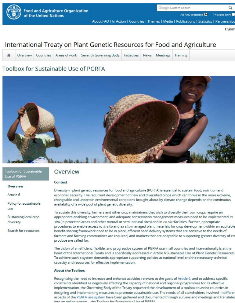
Figure 1. Screenshot of the Toolbox prototype home page

11. Figure 2 is a schema of the Toolbox prototype elements and structure. The home page provides an introduction (explaining the Toolbox context, purpose and scope, including which stakeholders may benefit from using it), as well as user instructions. The navigation menu provides links to the home (overview) page, the text of Article 6, 8 the sustainable use ‘subject areas’ (currently ‘Policy for sustainable use’ and ‘Sustaining local crop diversity’), and the resources database search function. The subject area pages each provide a general overview of the subject, summaries of key strategies and activities that can be promoted and implemented, and a search function for users to find subject related resources.