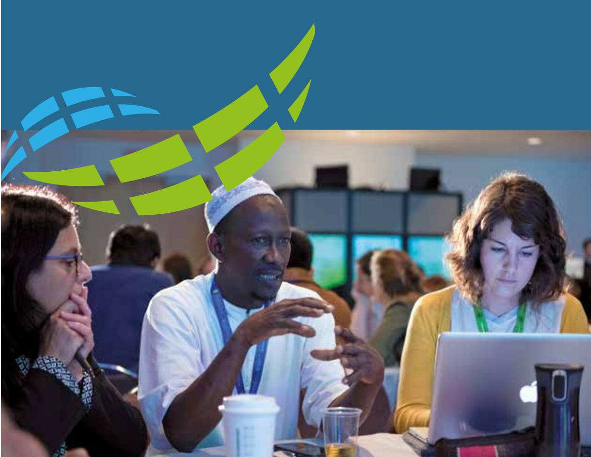
Photo 5. Collaborative exchange and dialogue session.