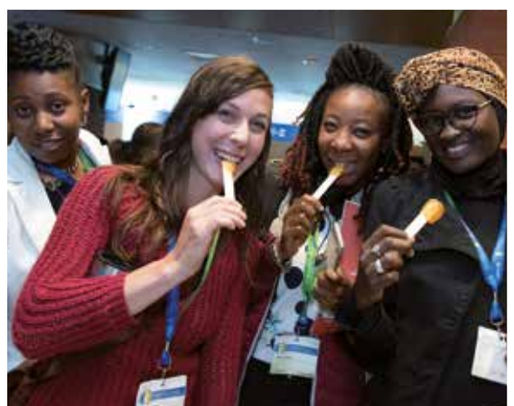
Photo 27. Maple syrup production. Photo 28. Thematic break, maple syrup on snow.