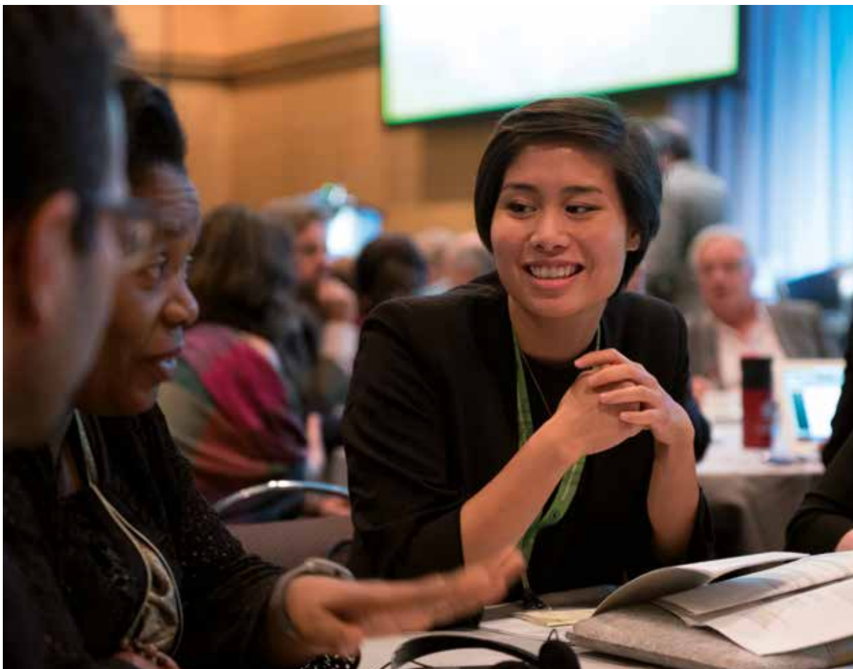
Photo 14. Collaborative exchange and dialogue session.

It is therefore crucial to highlight the multiple ecological, socio-economic and cultural functions of agroforestry systems with regards to biodiversity, food security, and sustainable development. While the link between forests and carbon sequestration is now widely acknowledged, the relationship between forests and food is still poorly understood. The multidisciplinary and decompartmentalization of agricultural, forest and land policies, the establishment of training programs for rural stakeholders, and the implementation of grant programs are central to a broader reconciliation of agricultural and forestry practices. As one participant noted, integrating trees and agriculture represents a paradigm shift that requires building bridges between disciplines, stakeholders and policies.