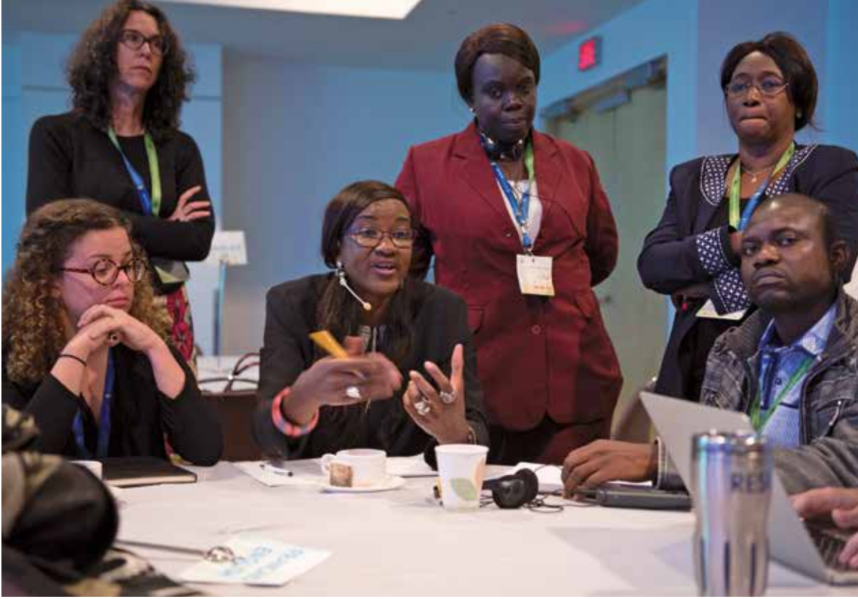
Photo 17. Collaborative exchange and dialogue session.