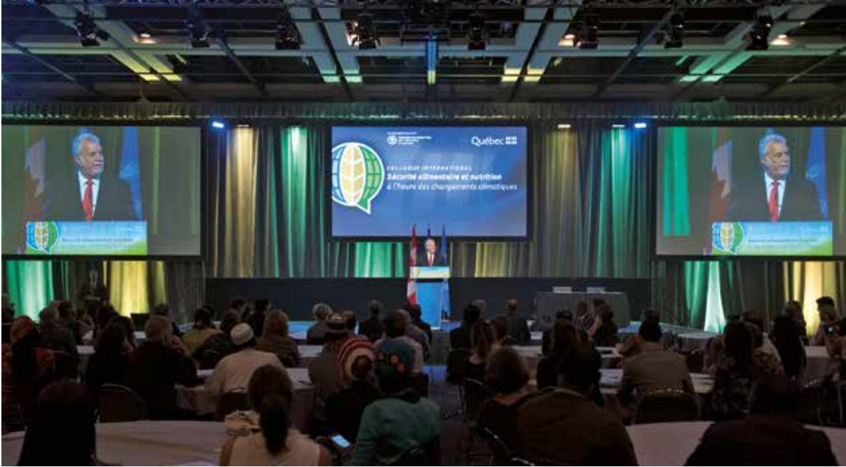
Photo 4. Opening speech by the Premier of Québec, Philippe Couillard.