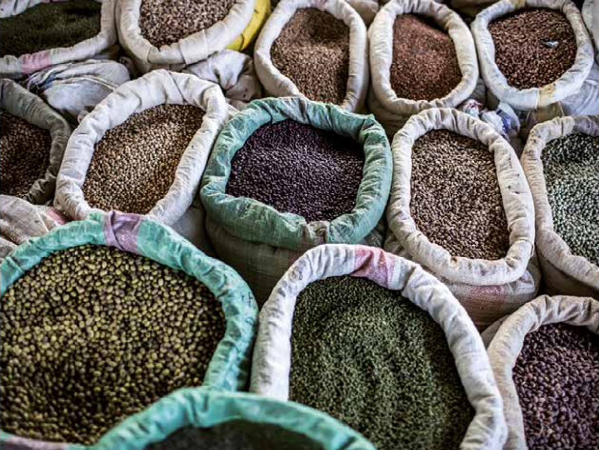
Photo 18. Cereals, beans, sorghum and other seeds at a stall in a market, Meru County, Kenya.

objectives. One of the essential roles of biodiversity is to integrate resilience into agriculture in order to reduce its vulnerability to natural disasters while at the same time, enabling agriculture to contribute to climate change mitigation and adaptation.