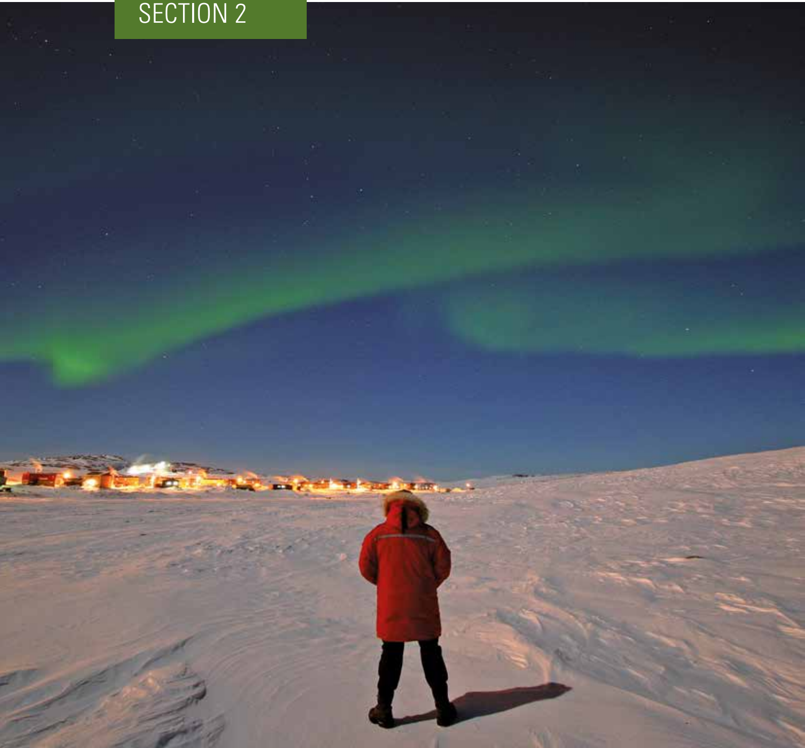
Photo 6. Aurora borealis north of the 49th parallel.