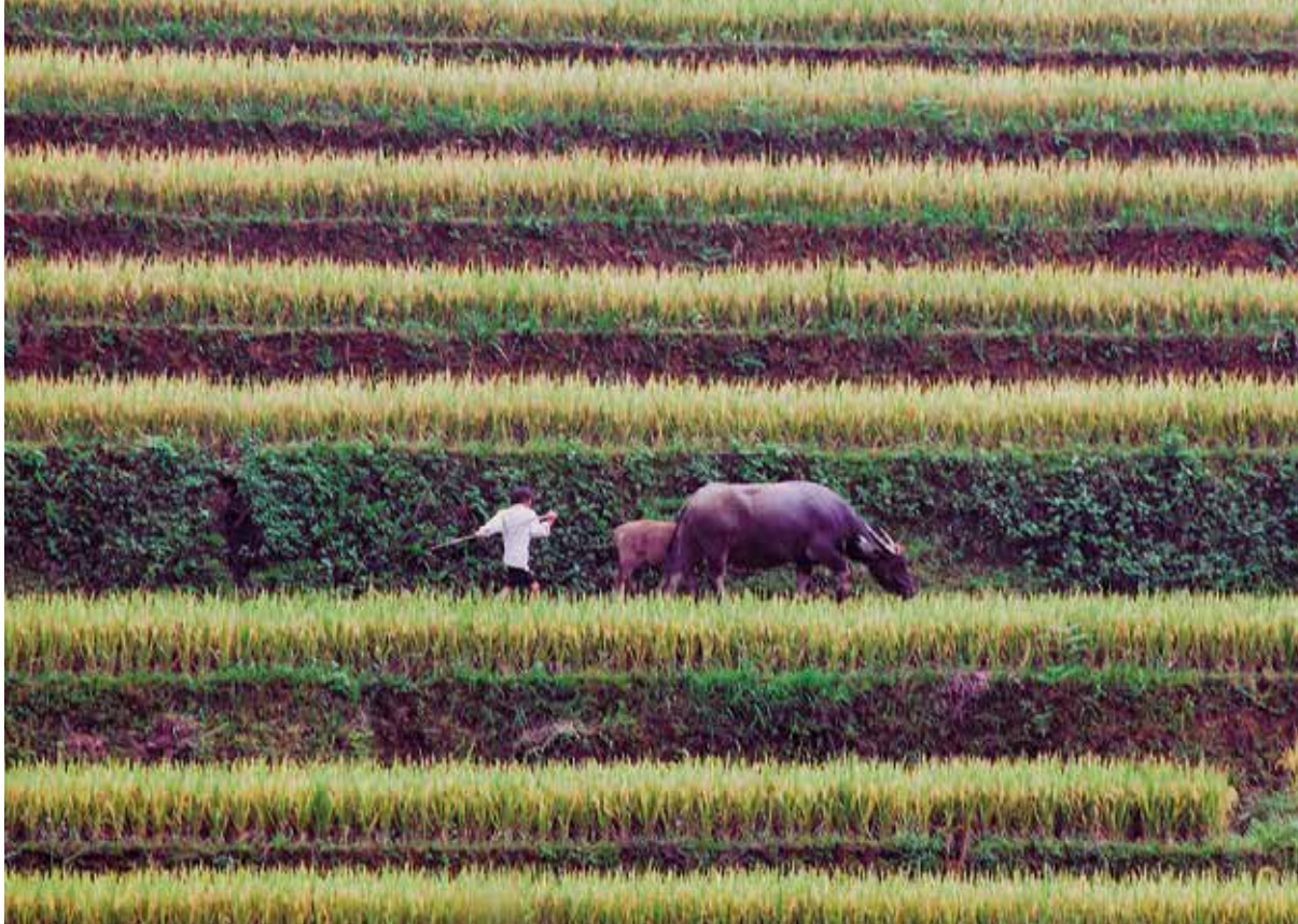
Photo 15. Mountain Herdsboy in Mu Cang Chai - Yen Bai province (Vietnam).