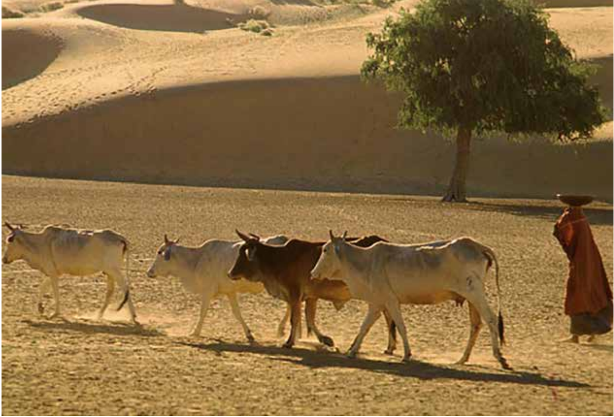
Photo 12. Bringing home cattle at sunset to a small settlement in the desert.

socioeconomic units, as well as their livelihood protection threshold.