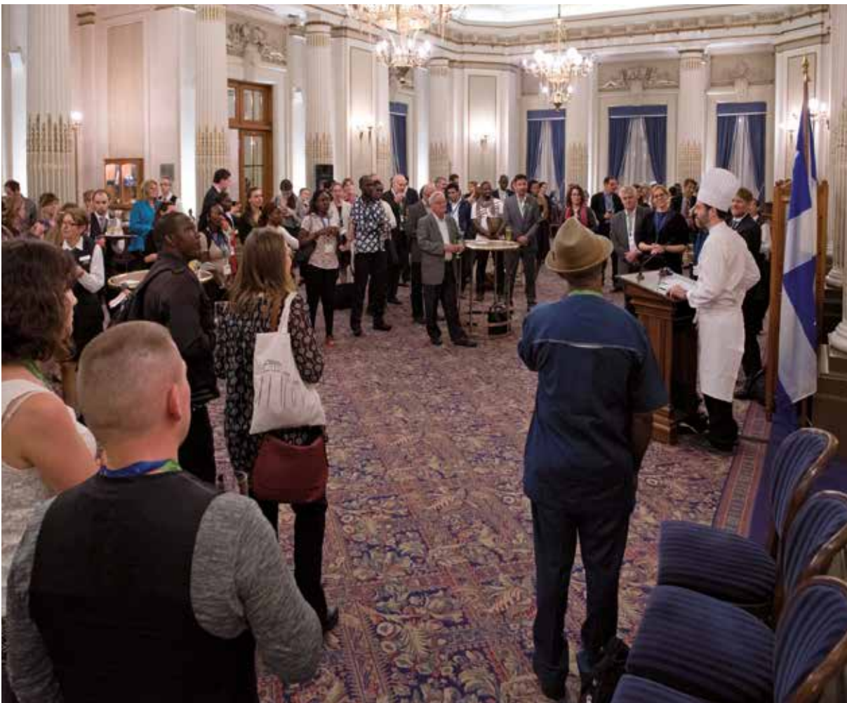
Photo 26. Parliamentary reception at the National Assembly of Quebec to taste the products of the National Assembly's garden.

development structures as well as with specialized private companies and non-governmental organizations (NGOs) that provide new solutions and support for implementing effective strategies to increase resilience. An example of note is the effort underway in Senegal, where new multi-stakeholder collaboration is being established between the FAO, the Ministère des Relations internationales et de la Francophonie (MRIF) and international cooperation agencies. This collaboration is specific to communities of practice and enables them to share a variety of expertise and experiences.