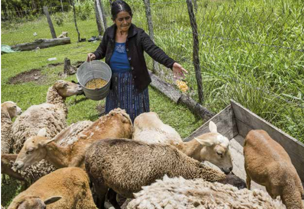
Photo 11. A farmer feeding her sheep.

Cattle farming is also a major activity in the Haitian family farming economy. Support is provided for a network of mini dairies in order to give smallholder farmers better access to the milk market.