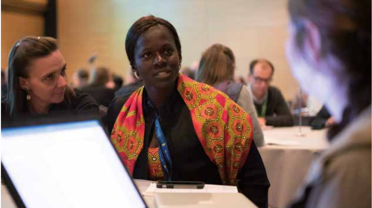
Photo 10. Collaborative exchange and dialogue session.