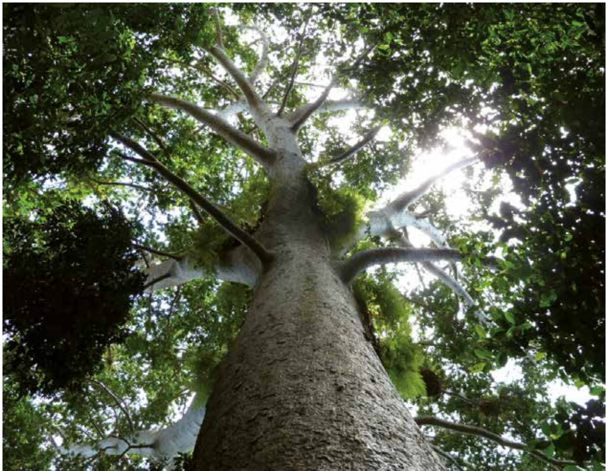
Photo 13. Giant of Kauri Forest, Erromango Island, Vanuatu.

The participants therefore argued that agroforestry represents an alternative to the forest-agriculture clash when it comes to land use. A Senegalese participant stated that a number