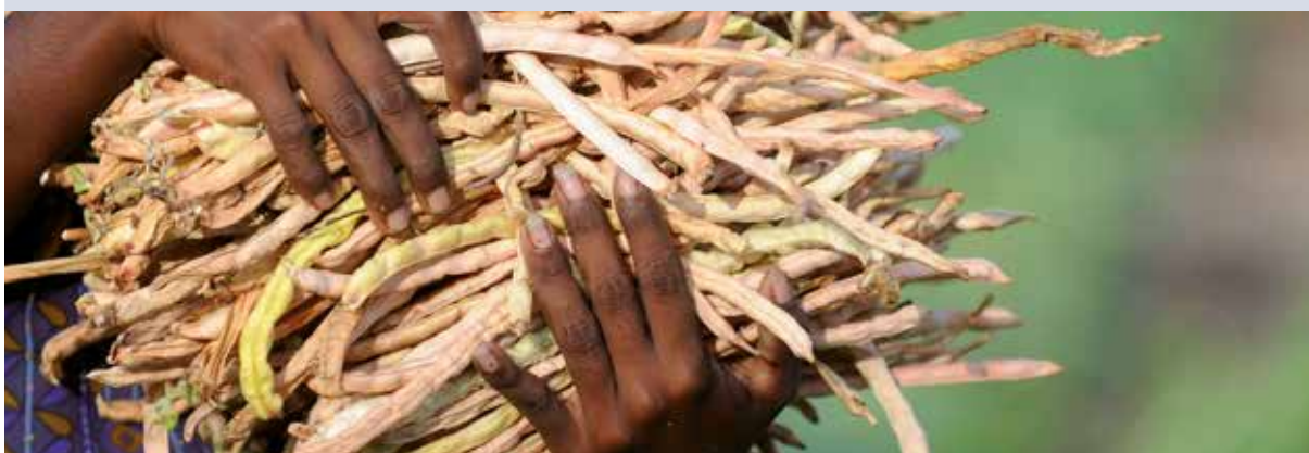
Photo 9. A woman farmer harvesting beans.