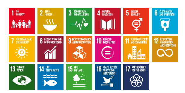
CAS 7: Evidence-based outreach initiatives to improve global urban food governance and to boost investment

Acknowledging that limited resources are available to assist in all situations, this CAS serves as a global catalyzer for facilitating exchange along with the scaling up and scaling out of good practices and successes. In this respect, FAO will serve as a knowledge broker for countries and their sub-national governments on food systems and related issues in partnership with relevant global actors (notably UN agencies) and city networks. Special attention will be paid to local governments in low and low-medium income countries, which, to a large extent, have been absent in international municipal cooperation and are often not empowered to act on food systems.