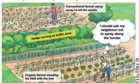
Figure 6. How to reduce the risk of GMO contamination