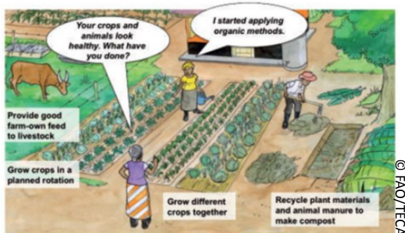
Figure 4. Which crops should I grow