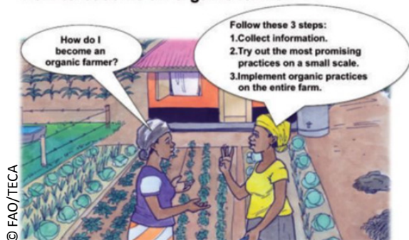
Figure 2. How to get information on organic agriculture