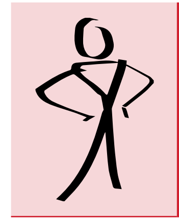
Figure 3.1. The two sides of concern arising from diversion from intended use.

Exporting contracting parties - do not want to face unjustified measures