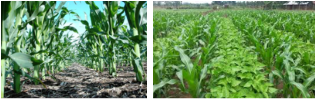
Figure 2. Conservation agriculture in maize production in Zambia: mulching (left) and intercropping with legumes