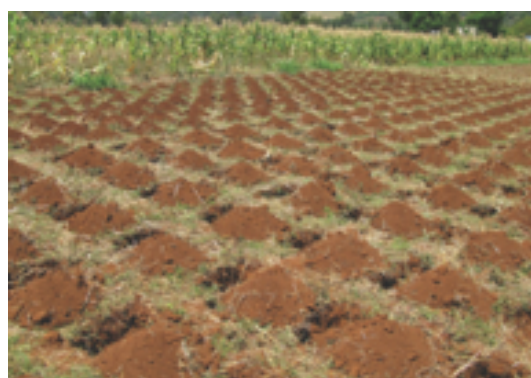
Figure 1. Conservation agriculture as applied in Zambia: Planting basins (left) and ripping (right)

Minimum tillage (planting basins and ripping) is a common entry point of CA (see Figure 1). The biggest impediment of the minimum tillage approach is weed growth, which favours conditions with minimum soil disturbance. Ripping, which involves creating a small furrow without turning the soil, is more popular than using planting basins; small pockets of soil, which are hoed and filled with seed and fertilizer. Basins are typically applied to smaller pieces of land compared to ripping, and are more labour intensive.