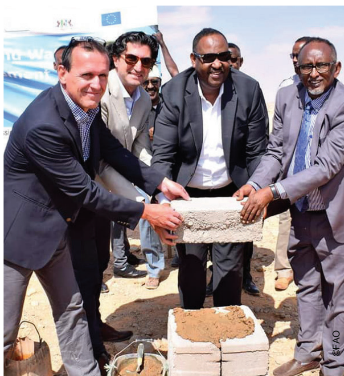
Figure 1: President Deni laying the foundation stone for the Information Management Center

The IMC is established by the Food and Agriculture Organization of the United Nations (FAO) in collaboration with the Government of Puntland through funding from the European Union.