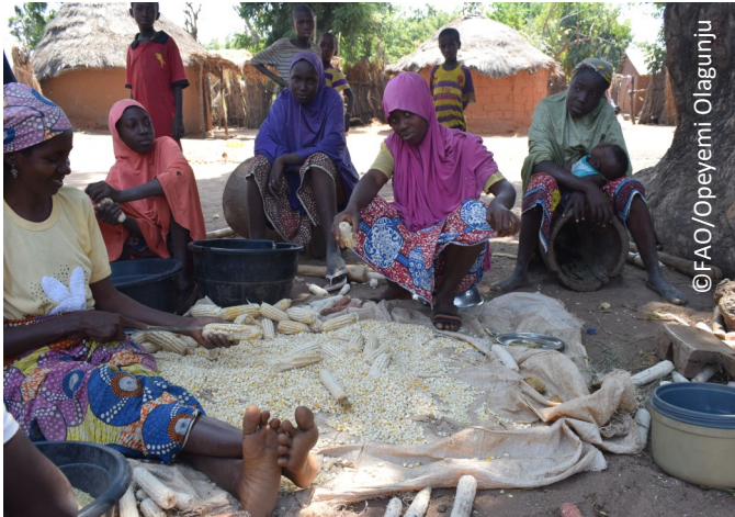
Ubandoma community, Adamawa State: Harvests from family farms generate processing opportunities for rural women.

“The seeds we got were lifesavers, they gave us a chance to rebuild our lives faster than we thought,” Jouro says. The local varieties of maize, which the farmers were accustomed to, typically produced one cob per stick but the variety distributed by FAO produced better and more cobs of maize per stick. Therefore, with a small portion of land, the farmers were able to cultivate and harvest more.