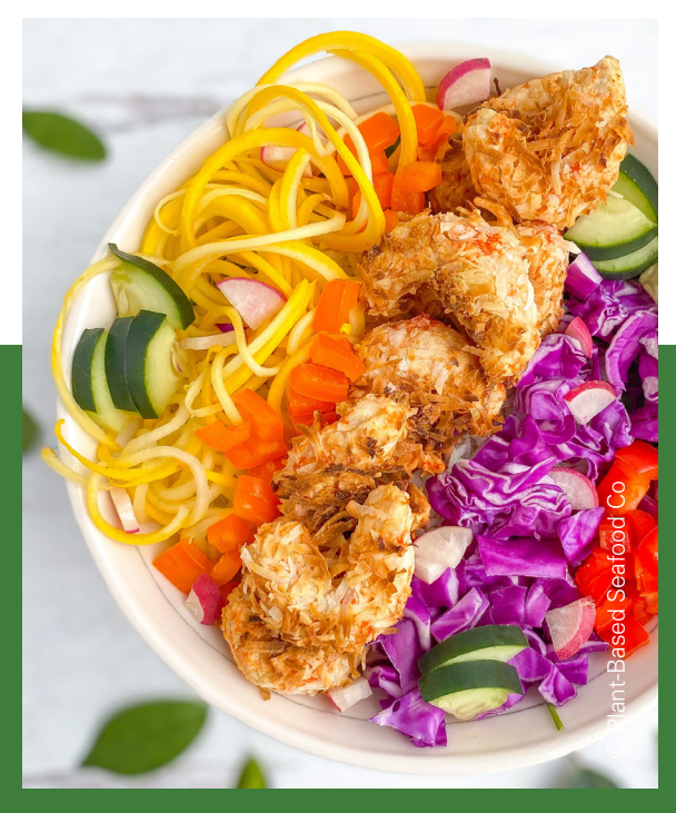
Replicated taste and texture of shrimp with plant-based ingredients