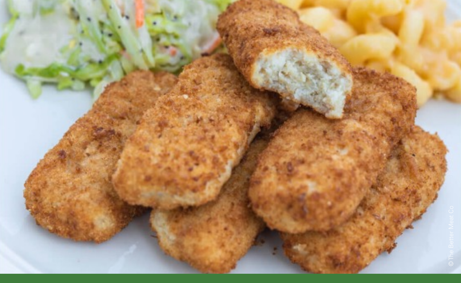
Rhiza can be flavoured or blended with other products to create a sustainable seafood alternative.