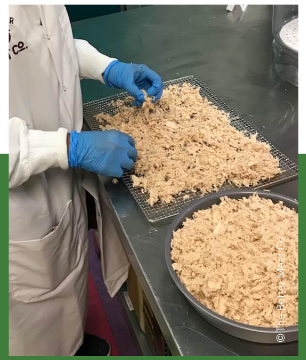
Fermented mycelium to create Rhiza, a protein and fibre-rich meat and seafood alternative

As the sector evolves, it is now also beginning to attract the attention of corporate food producers. Many of these companies hope alternative seafood can emulate the success of the plant-based meat sector. This was valued by the GFI at USD 1.4 billion in 2020 and it has established a foothold in mainstream markets, with plant-based alternatives to meat products, such as burger patties, now found in some of the most famous fast-food franchises in the world.