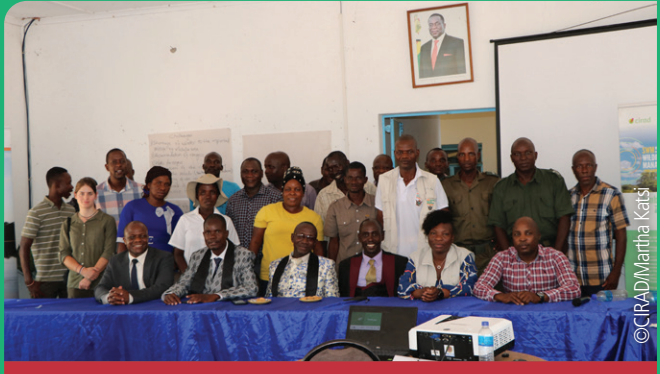
SWM Programme key stakeholders engaged in Phase II discussions.

Key stakeholders participated in a review and planning meeting held by the SWM Programme in Zimbabwe to discuss priorities and areas for improvement during the second phase. Click <u>here</u> for more information.