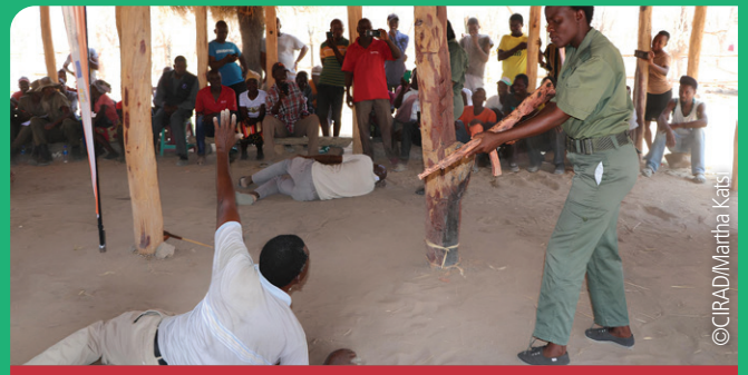
Intembawuzyo Arts Production Drama Performance shows a game ranger catching poachers during patrol. In Zimbabwe, wildlife poaching attracts a minimum nine-year jail term for protected animals such as rhino and elephant.

Five theatre performances took place in Binga (Wards 3 and 4) to strengthen community understanding of the SWM Programme and provide the tools and understanding to reduce conflicts between humans and wildlife. Click <u>here</u> to read more about this event.