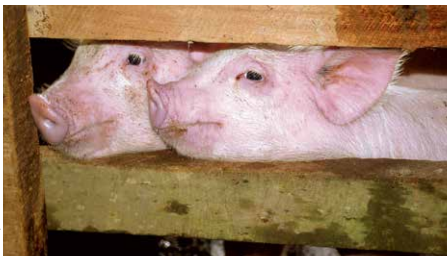
Smallholders swine producers are the most vulnerable to the disease impact.

A majority of high producing pork states in the United States of America, several provinces in Canada and most of the high producing pork countries in Asia have recently documented cases of the virulent form of PEDv. Most high producing pork countries have had outbreaks of TGEv, and it seems likely that a similar pattern of PEDv outbreaks could occur in these countries if import restrictions and biosecurity are not improved. Both diseases are coronaviruses, and both cause high mortality in neonatal piglets. In many countries, it used to be believed that TGEv was a foreign disease, but this may not be true today. The situation may be similar for PEDv. Following the interest caused by the PEDv epidemic in the United States of America, several Latin American countries, such as Colombia, the Dominican Republic, Mexico and Peru, have reported the disease, suggesting that PEDv may be more widespread than previously thought. Raising awareness of the disease will therefore help to improve surveillance, early detection and reporting of the disease in other countries, where small-scale farms in the swine sector are the most affected because of the virus's devastating effects on farmers' livelihoods. ●