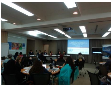
Panel discussion on "Technological change and its impact on women's economic empowerment".

The topic of the policy dialogue – women's economic empowerment in the changing world of work – aligns with the priority theme of the 61 st session of the CSW (13-24 March 2017, New York). As such, the outcomes and recommendations of the policy dialogue are intended to feed into preparations for the 61 st session of the CSW with a view to strengthening the regional perspective and prepare countries from the region for the CWS meeting.