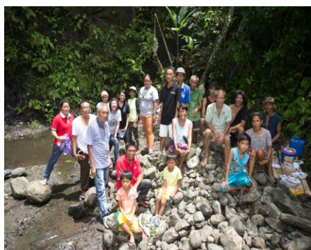
Residents of Barangay, Lupo and Catmon are working together to construct a water impounding system, using the tools and materials provided by FAO in partnership with NNC and with funding support from UNICEF.