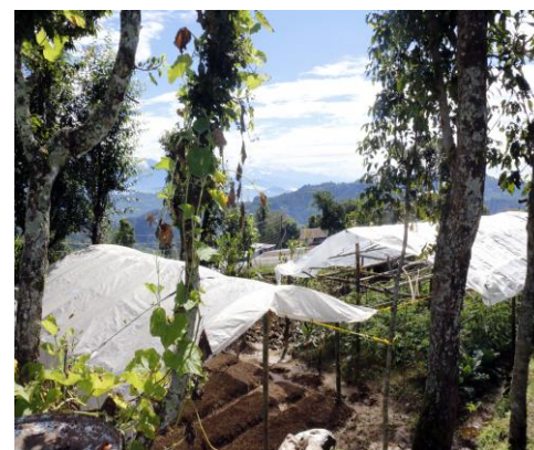
Vegetable farming tunnels in Jaisidada.

The Jaisidada Women's Community Farmers Group produced about 57 600 kg of winter vegetables. After selling 62 percent of their production (about 35.8 metric ton), they earned NPR 1 432 000, equivalent to USD 13 638 (approximately USD 422 per household). The rest of the production of winter vegetables was used for domestic consumption.