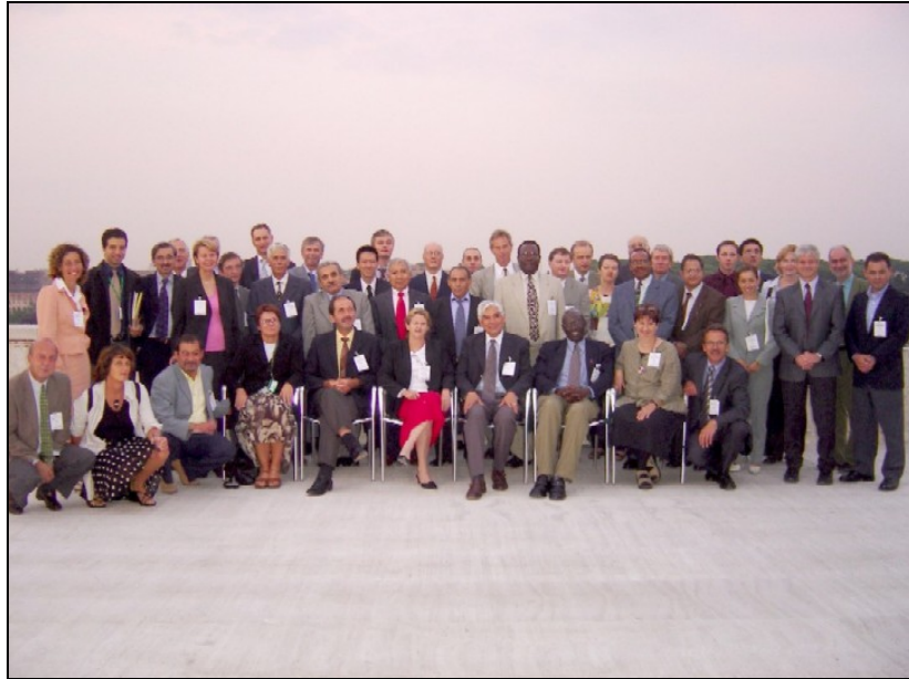
Participants in the Second Meeting of the Adelboden Group, 4 October 2004

In accordance with the participatory, evolving and open-ended design of the multi-stakeholder SARD-M Project, a discussion note on proposed project activities and related implementation modalities, and a questionnaire on partners' interests, needs and priorities were prepared by the project team and circulated to invited participants prior to the meeting. The questionnaires completed by the participants were assessed by the SARD-M Project Team and a summary of their comments and recommendations was presented during the meeting 3 .