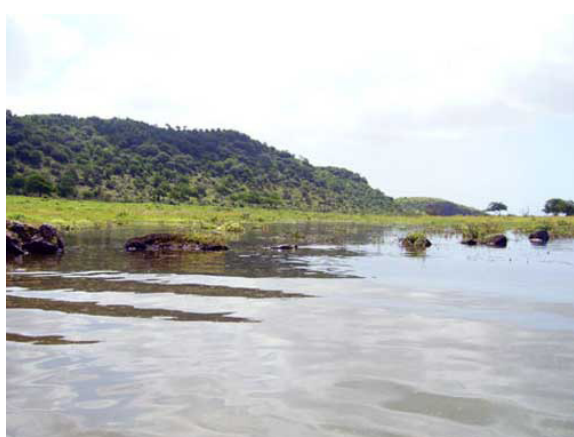
Photo 7. Wadi Darbat pools