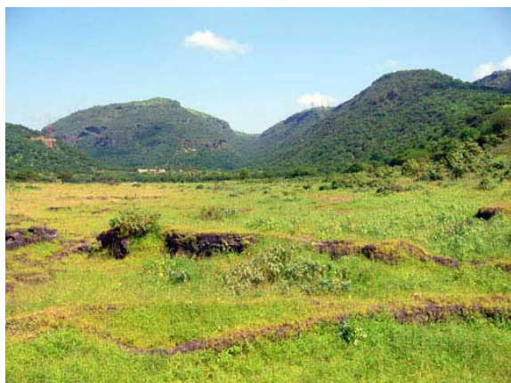
Photo 5. Summit grasslands