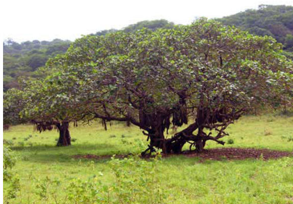
Photo 3. Ficus vasta