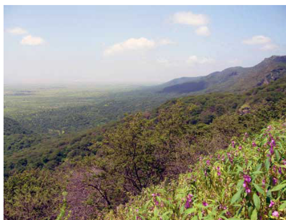
Photo 4. Densely vegetated sea-facing slopes

populations but estimates in 1993 put the urban inhabitants at 40%. According to the 1997 census the category of ages under 14 years represents about 46% of the population; 25–65 years olds represent 51%, and over 65 years old 3%. This frame of age categories is expected to have an effect on the type of preferred careers: traditional ones - farming, herding and fishing are expected to decline. The huge availability of services in urban centres has motivated emigration from rural areas. The internal emigration net rate is estimated at 1.42 per 1 000 citizens. There is random rural emigration in response to drought, environmental deterioration and declining soil productivity, raising urban population density and putting more pressure on resources.