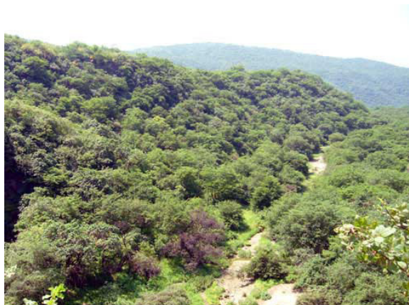
Photo 1. Dense woodland in Dhofar