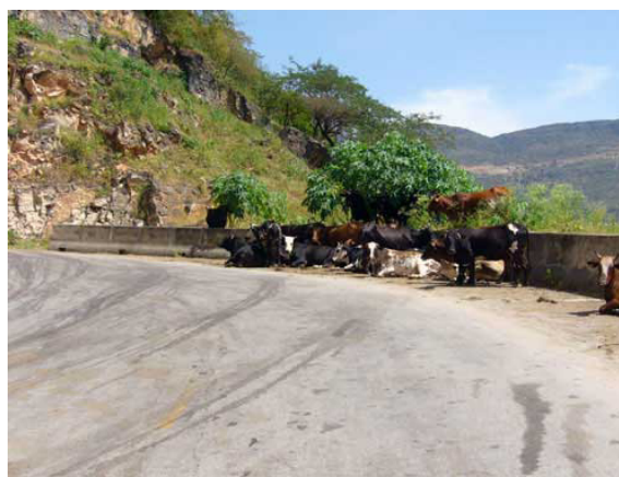
Photo 8. Typical local cattle

intrusion of sea water and its mixing with groundwater in coastal sites. A study by the Ministry of Regional Municipalities, Environment and Water Resources indicated that the annual water shortage exceeds 300 million m 3 .