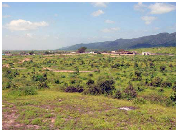
Photo 2. Eillop coastal plain