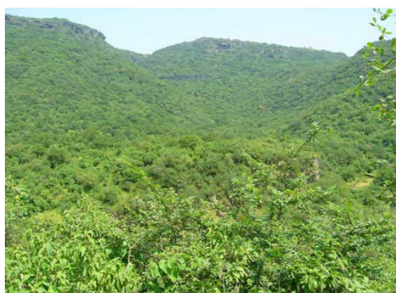
Photo 6. Typical escarpment woodland