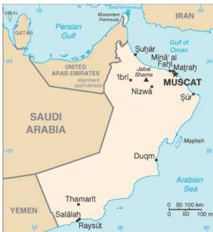
Figure 1. Map of Oman