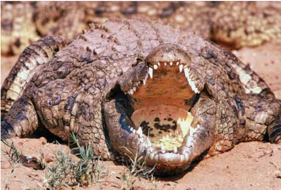
FONDATION IGFID, ROQUES-ROGERNY