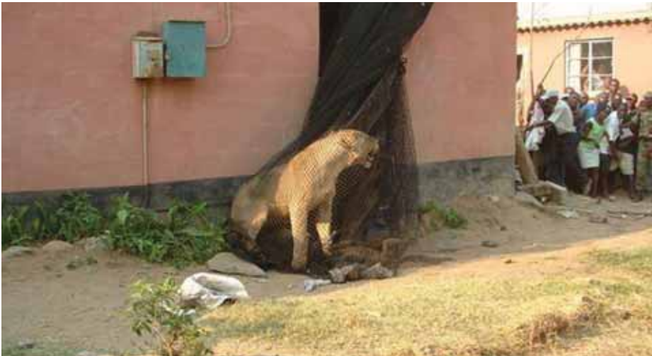
M. LA GRANGE

Wildlife can be a safety concern for people in rural areas