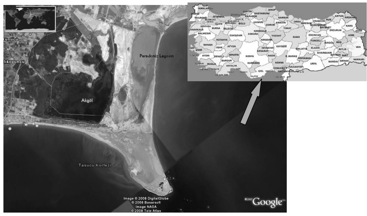
Figure 1. The map of Paradeniz and Akgöl Lagoon Complex in Göksu Delta.

The Göksu Delta (Fig. 1) is situated on the Southern part of Turkey along the Mediterranean coast. It has two lagoons known as Paradeniz and Akgöl which, have formed as a result of the accumulation of sediment carried by the Göksu River, the lagoons areas are 390 and 1200 ha respectively.