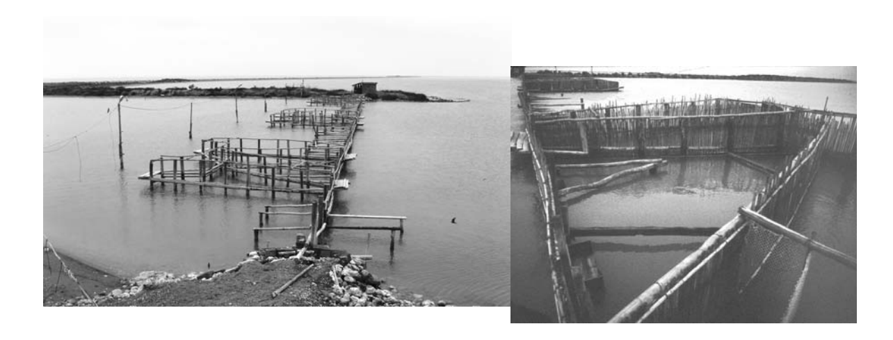
Figure 3. The fishing barrier in the Paradeniz lagoon