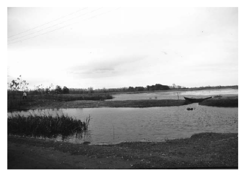
Figure 2. Akgöl Lagoon.