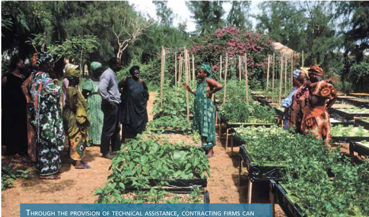
THROUGH THE PROVISION OF TECHNICAL ASSISTANCE, CONTRACTING FIRMS CAN PROMOTE IMPROVEMENTS IN AGRICULTURAL PRODUCTIVITY AND FARMER'S INCOME.

and buyers should guarantee that they will purchase the product from farmers as scheduled. In turn, farmers should supply the produce, meeting the quality standards specified in the contract.