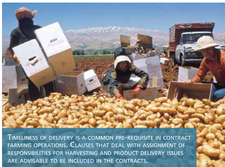
TIMELINESS OF DELIVERY IS A COMMON PRE-REQUISITE IN CONTRACT FARMING OPERATIONS. CLAUSES THAT DEAL WITH ASSIGNMENT OF RESPONSIBILITIES FOR HARVESTING AND PRODUCT DELIVERY ISSUES ARE ADVISABLE TO BE INCLUDED IN THE CONTRACTS.

Contractors expect farmers to engage in production practices and procedures that are conducive to producing good quality products. Such practices include proper use of production inputs, which are recommended for the type of agricultural product to be grown or reared. Farmers are also expected to follow good management practices, which may include maintenance of hygienic conditions, use of