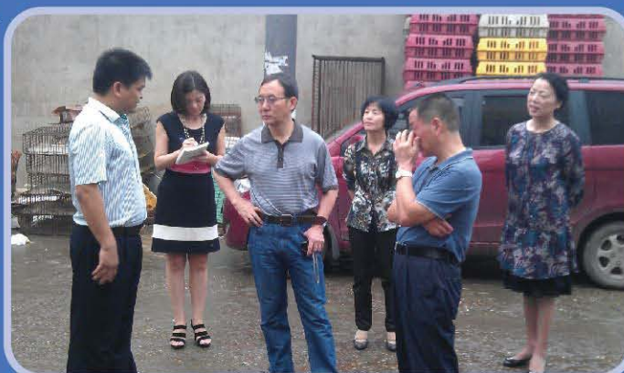
▲ Discussion with LBM owner and local veterinary authority