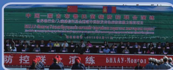
▲ Opening ceremony

The China - Mongolia joint exercise on the prevention and control of brucellosis was held on September 17 in Xilingol. Representatives from World Bank, Mongolia, Chinese Ministry of Agriculture (MoA), local government and FAO ECTAD China attended the event. Major Chinese media, such as China Central Television (CCTV), People's Daily and Xinhua News Agency reported this event.