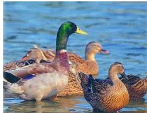
Wild ducks at the mouth of the Danube

FAO's warning followed the detection of H5N1 in diseased young domestic ducks by German scientists.