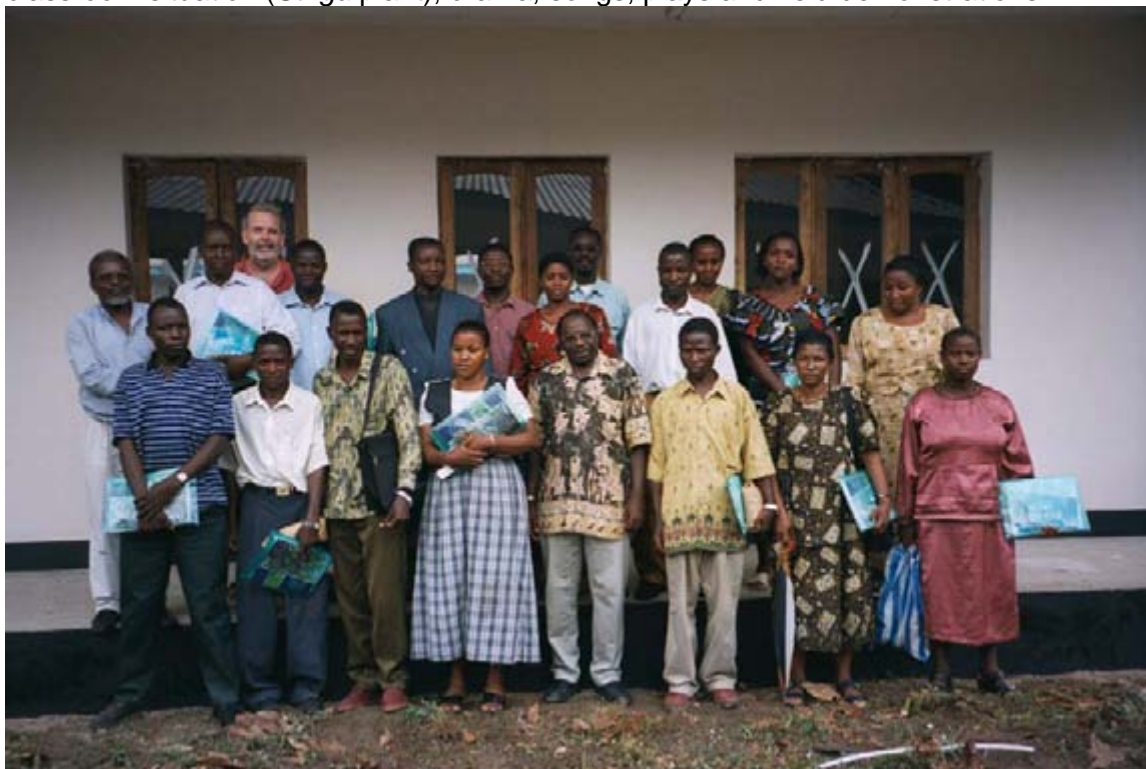
Participants of the Primary school teachers Workshop, Kyela 2004

The teachers were briefed on the biology and Striga control options by using learning tools, which included posters showing Striga biology and integrated control options, leaflets and a Striga manual. The outcome of the workshop was an agreed strategy for the incorporation of awareness and control of Striga into school curriculum, the spread of this knowledge to other schools and the community surrounding the schools. In a follow up workshop teachers gave a highly positive account of their experiences of incorporating awareness of Striga biology and control into their school curriculum. Different teaching methods were described including lecturing, using of real objects in classroom situation ( Striga plant), drama, songs, plays and field demonstrations.