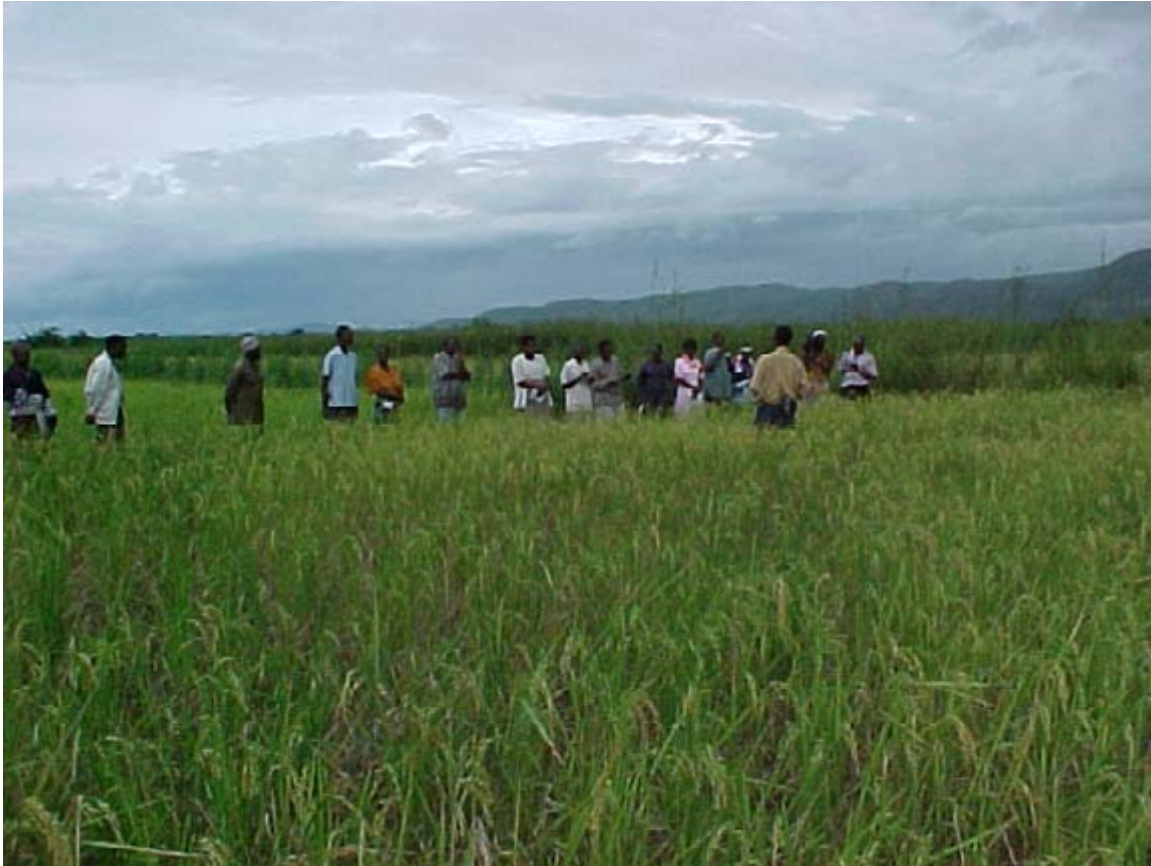
Farmers evaluating rice performance following Crotalaria , Kyela 2003

Schools: A partnership was established between researchers, extension and teaching professionals at each project site to determine how knowledge of the Striga biology and control using green manure could be incorporated into primary school agricultural sciences curriculum. A training workshop was held for two days at each site involving 15 schools from Kyela and 6 schools from Matombo as shown on the following tables below and the details are presented in Working paper No.5 (2003)