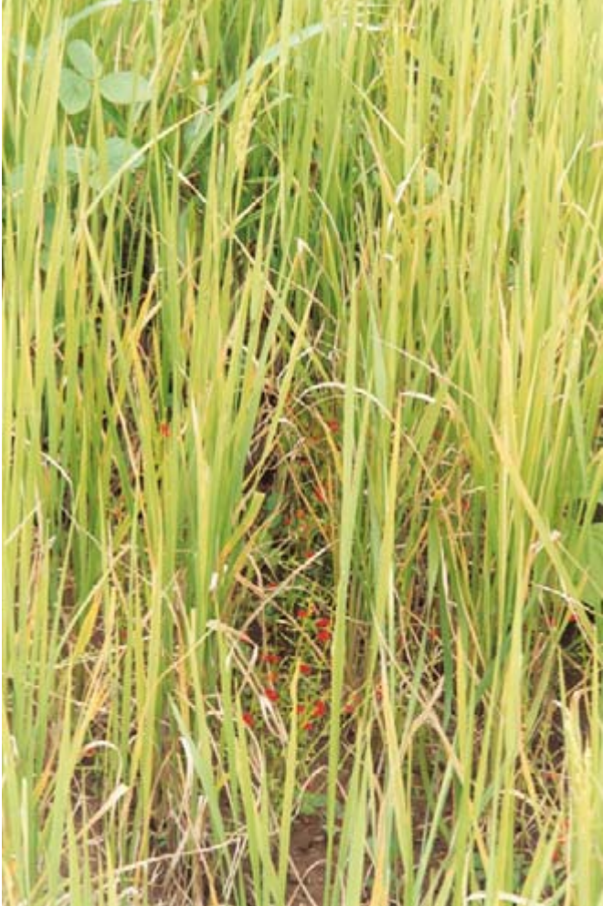
Striga infested field –Kyela 2004

project farmers in participating villages have begun to adopt the use of the green manure on a large scale, Striga infestation has decreased, and the yield decline in rice, identified by farmers as a major cause for concern, has been reversed. The project has demonstrated the value of using a range of partnerships, including research, extension and schools to promote knowledge on improved agricultural practices. Extension materials have been produced that can be used elsewhere in the country to support promotion of cereal/legume rotations that improve farm productivity and incomes.