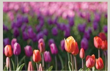
Canadian Tulip Festival – May 10 - 20, 2019:

One of the world's largest tulip festivals showcasing magnificent displays of millions of tulips in Canada's National Capital Region.