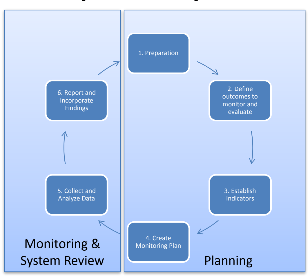
Figure 1: Performance Monitoring Framework