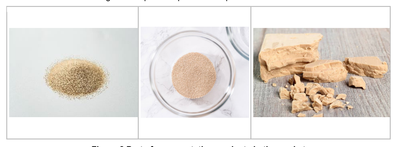
Figure 2 Part of representative products in the market

Products can be classified into liquid baker's yeast, fresh baker's yeast and dry baker's yeast according to their moisture content. See Figure 2 for part of representative products in the market.