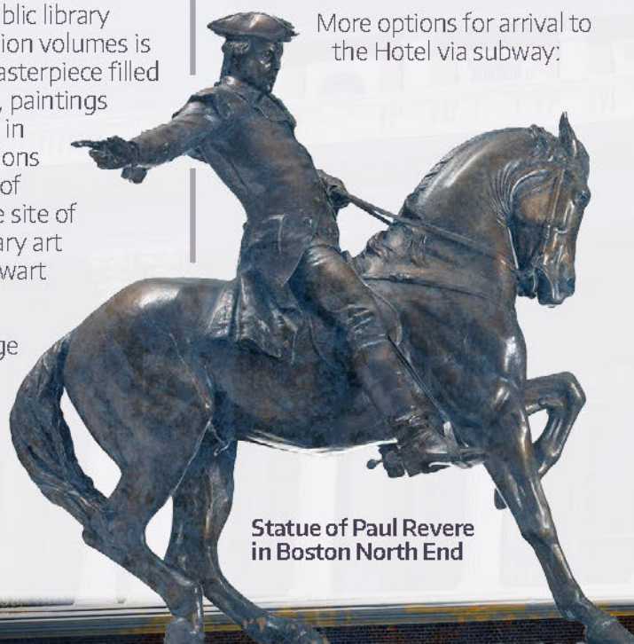
Statue of Paul Revere in Boston North End

All other times, including Weekends: $26.25 per taxi (1- 4 passengers), mini vans and station wagons are slightly more, all fees are subject to change.