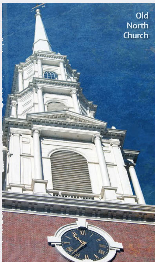
Old North Church

Here is just a sampling of the many attractions and events Boston offers: