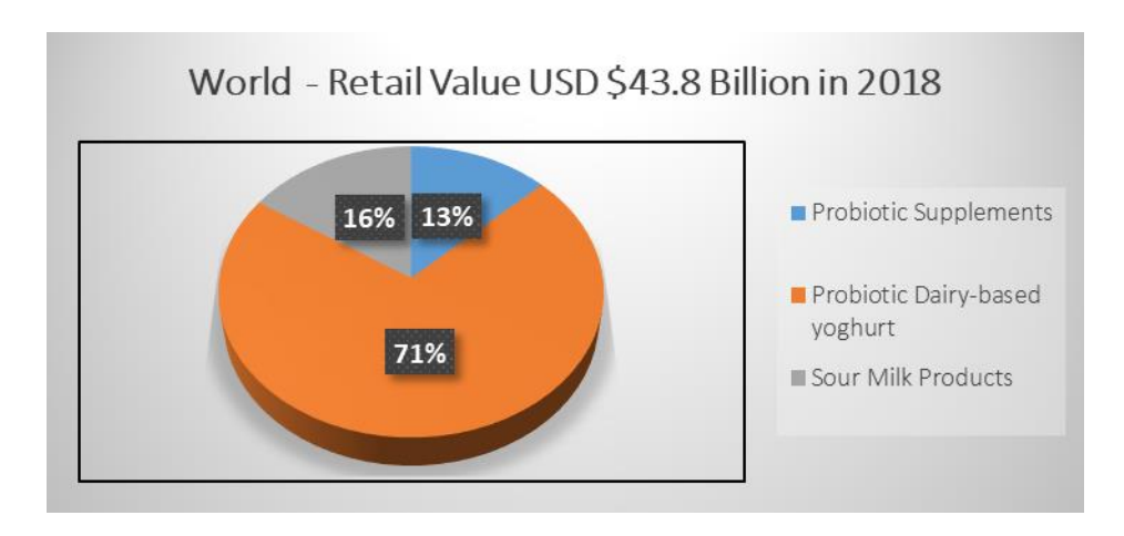
Graph 1: Global Retail Value, 2018

22. Probiotics are consumed in foods, beverages and dietary supplements. Foods include mainly dairy products as yoghurts and other fermented milks as represented in graph 1 and table 1.