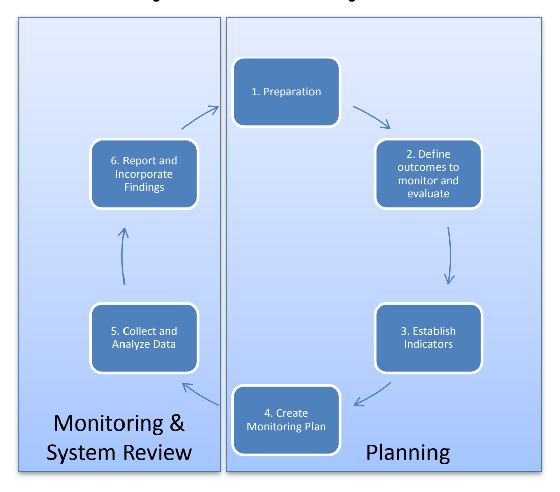
Figure 1: Performance Monitoring Framework