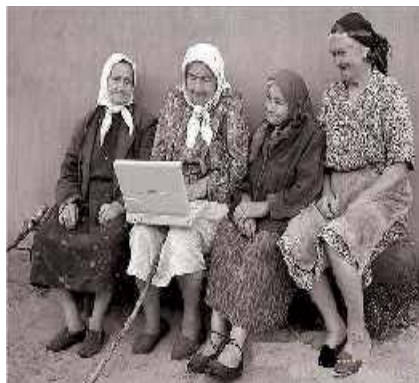
Education for Rural people in Kosovo

If you are interested in participating in this initiative, please contact us.