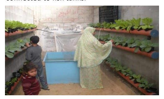
Vertical rooftop garden at a beneficiary home

Through the first phase of the project, among other activities, beneficiaries were provided with vertical rooftop gardens connected to fish tanks.