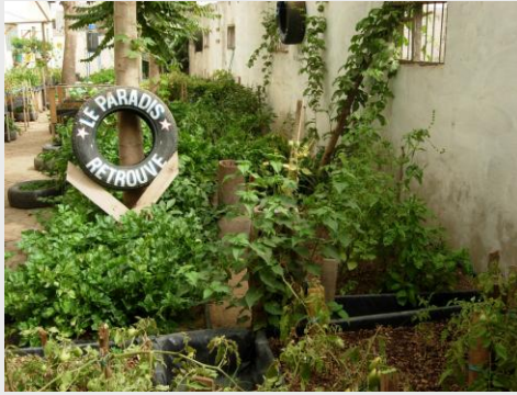
Microgarden in the City of Dakar