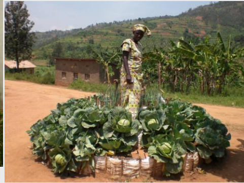
Urban and peri-urban agriculture in the City of Kigali