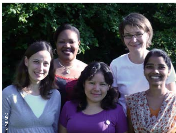
MIJARC's International Women's Commission is composed of one representative from Asia, Europe, Africa and Latin America, and one member of its World Team.

are empowered at all levels in relation to their rights and their participation to take leadership". In this respect, its different member movements are working on a wide range of activities. CARYM (Catholic Agriculture Rural Youth Movement) Zambia, for example, organises training for young rural women in the field of food sovereignty and leadership. CARYM Uganda provides training in entrepreneurial skills, and MIJARC's member movement in the Democratic Republic of Congo is working on the participation of women in different aspects of life, the struggle against AIDS and the improvement of the living conditions of young rural women.