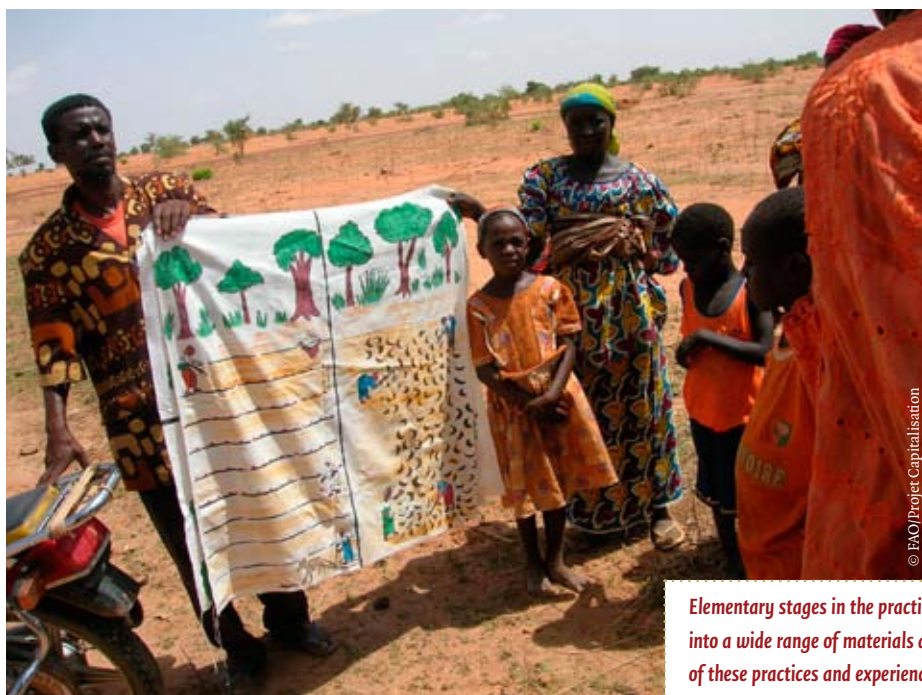
Elementary stages in the practice of capitalisation: transformation (packaging) of the practices into a wide range of materials adapted for the target audience, and exchange and dissemination of these practices and experiences using methods that enable good use of this knowledge.

This programme works in synergy with other FAO regional initiatives such as Water for Africa, the Farmer Field Schools, the Initiative on Soaring Food Prices, and its support for national food security programmes.