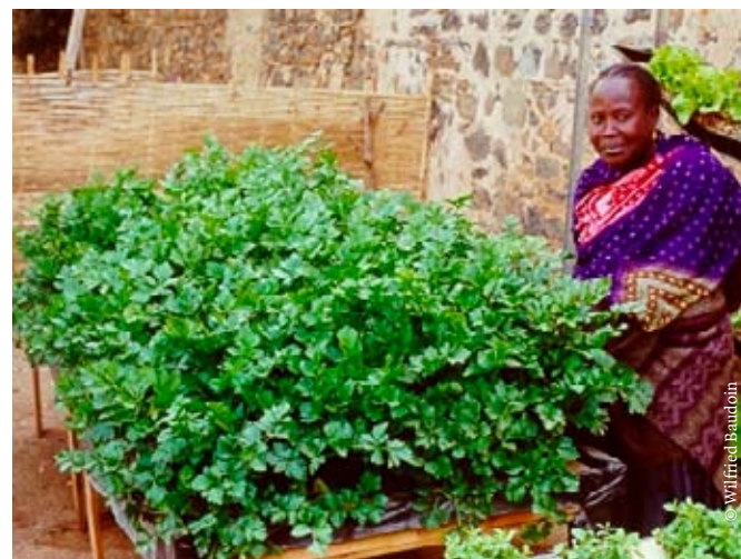
Microgardens are particularly popular with women. The main reason is that the physical labour required is considerably less than for conventional farming.

It is very encouraging to see how quickly poor families master this type of cultivation. Micro-gardens are particularly popular with women, mainly because the physical labour required is