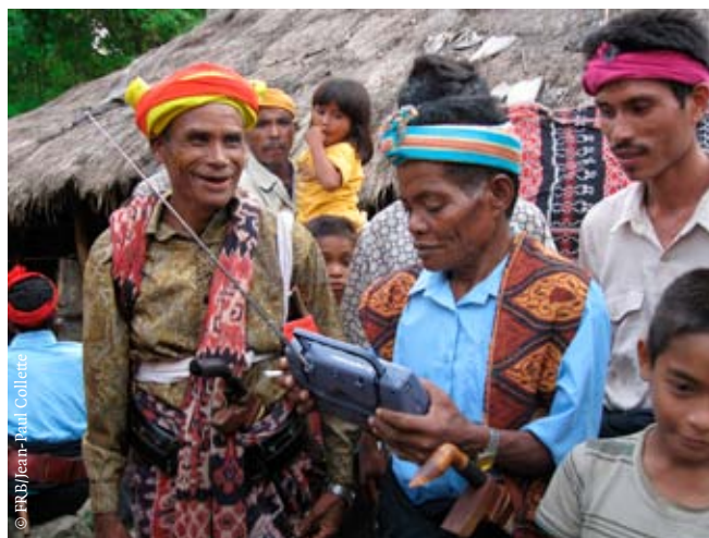
KBR68H is highly engaged on behalf of disaster victims, in the fight against corruption, and in the promotion of tolerance, pluralism and fundamental human rights.

KBR68H has widely diversified its sources of financing. It continues to enjoy the support of international NGOs, but also has private patrons and earns advertising income. Several ministries also pay for the broadcast of public service announcements about family planning, AIDS prevention, forest conservation and... the necessity of paying one's taxes.