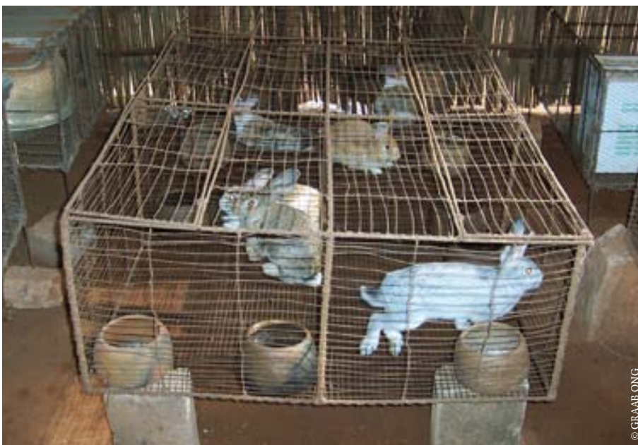
Each of the women received a breeding kit comprising two cages with four compartments, eight feeders, eight drinking troughs, a plastic bucket, a machete and four rabbits.

This activity has not prevented me from continuing my other activities, as it does not take up much time and is home-based, where my children can help me. I'm very happy and think the project can really help women take charge of their lives and face up to their situation. What I found particularly remarkable about the project is not only that it provides training, but that after being kitted out each woman receives individual assistance for six months. Subsequently, and after returning four rabbits to GRAAB to enable the organisation to help other women, too, each woman is fully responsible for what she achieves.