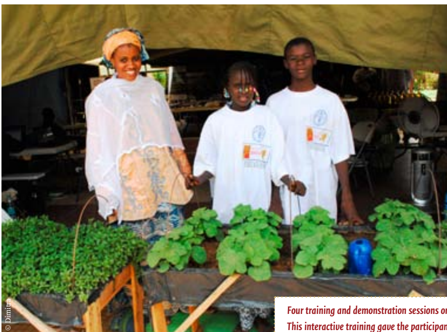
Four training and demonstration sessions on micro-gardening were held at the Knowledge Share Fair. This interactive training gave the participants a chance to discover first hand the benefits of micro-gardens.