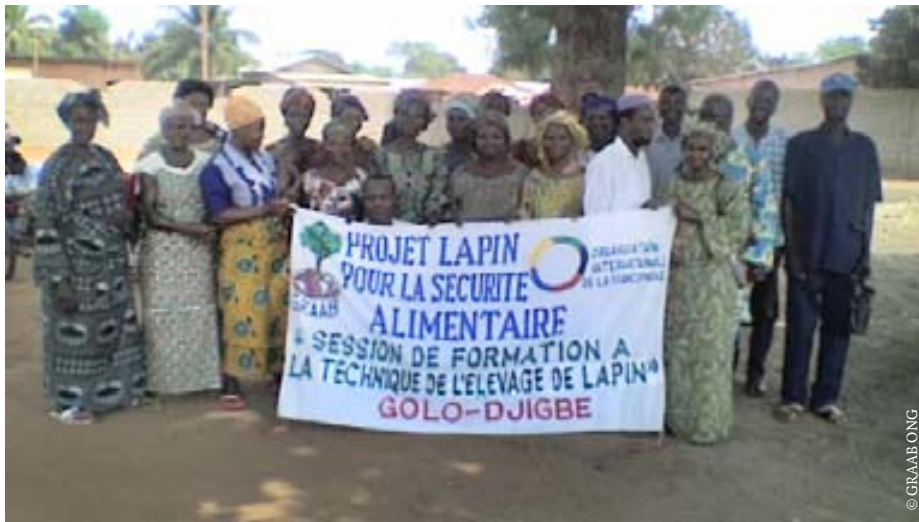
The women participating in the project were trained to raise rabbits and in basic accounting to help them better manage their activities.

tive cycle. The women were involved in every stage of the project process and each participant is responsible for her own affairs.