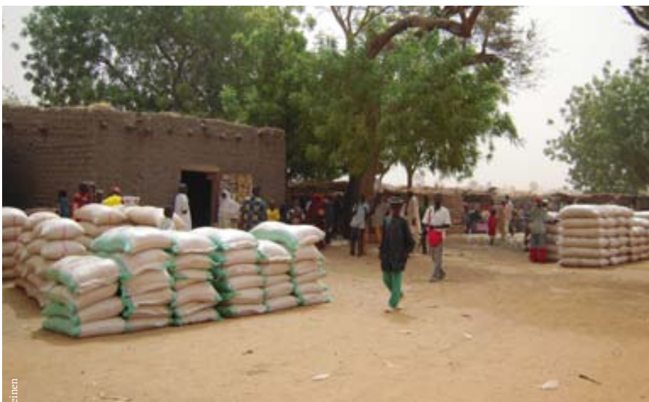
After the harvest, the farmers' organisations stock their members' agricultural produce in a safe, salubrious storage facility.

As a solution to this problem, the FAO's Inputs Project in Niger introduced warrantage. In November/December, just after the harvest, the farmers' organisations stock their members' agricultural produce in a safe, salubrious storage facility. The bank, usually a rural finance institution (RFI), then verifies the quantity and quality of the stored crops. The warehouse is secured with two padlocks, one for the bank and one for the farmers' organisation. The bank then provides a credit equivalent to 80% of the crop's harvest time value. This credit is extended to each member pro rata of their contribution to the overall stock. With the credit, the producers undertake an income-generating activity (IGA), such as livestock fattening, market gardening, processing or marketing. In May, with the earnings from their IGA, each member pays back the loan to their farmers' organisation, which reimburses the bank, which in turn releases the stock by returning its key. The members thus win twofold: the stock has increased in value and their IGA has provided earnings. It is estimated that this system boosts their revenue by 30%.