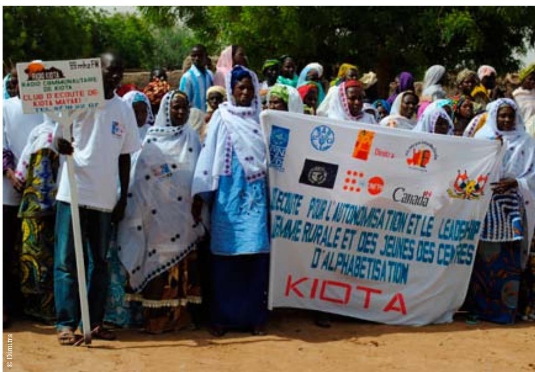
The members of the Kiota listeners' club at the project's launching ceremony in Dantiandou, in June 2010.

Very soon, the success was so great and demand so high that the clubs were given additional means of communication. About a hundred additional mobile phones were distributed to the listeners' clubs. These phones were linked up in a network known as a 'fleet', enabling cost-free communication at any time between the clubs and radio stations.