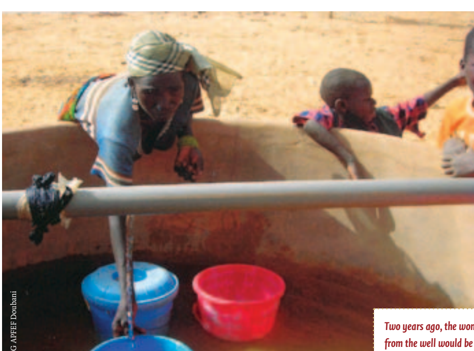
Two years ago, the women of this village would never have imagined that the water from the well would be used to irrigate land that will be theirs to use for almost a centuru.

Less than a year ago, a discussion was organised in the listeners' clubs around Dantiandou. This discussion looked at a key issue for everyone: local strategies to give women access to land. The debate on the community radio station enabled the women of listeners' clubs and radio listeners to exchange their views and suggest solutions: simply giving women land, with a legal document; purchasing land; the confiscation of land by the local authorities for community purposes