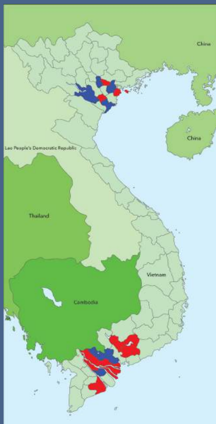
Figure 1: Provinces where EPT+ surveillance was conducted. Virus was not detected on farms in Blue Provinces, while farms in Red Provinces harvested one or more Influenza viruses.

The worldwide influenza pandemic of 2009 was caused by an H1N1 virus of swine origin. This human virus has repeatedly infected swines through reverse zoonosis, and has re-assorted with other swine viruses. This potential for recombination continuously poses new routes through which novel viruses may emerge to threaten human health.