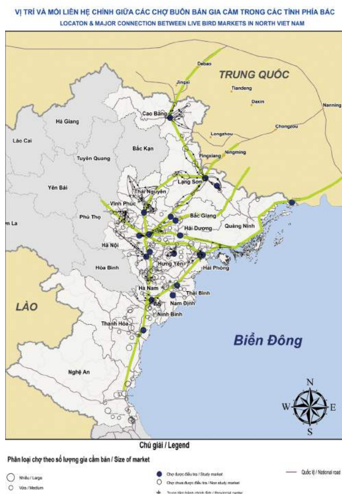
Figure 1: Map of main spent hen trade roads from China to Vietnam