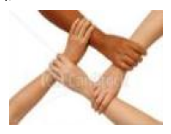
Coordinating body in the NENA region