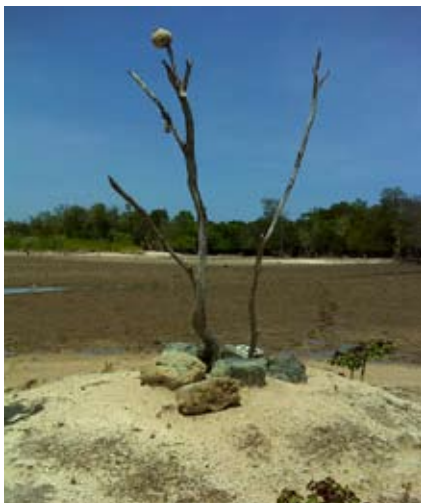
A marker showing an area protected by a Tara Bandu

RFLP is harnessing the power of traditional laws in Timor-Leste known as Tara Bandu to reinforce community management of coastal resources.